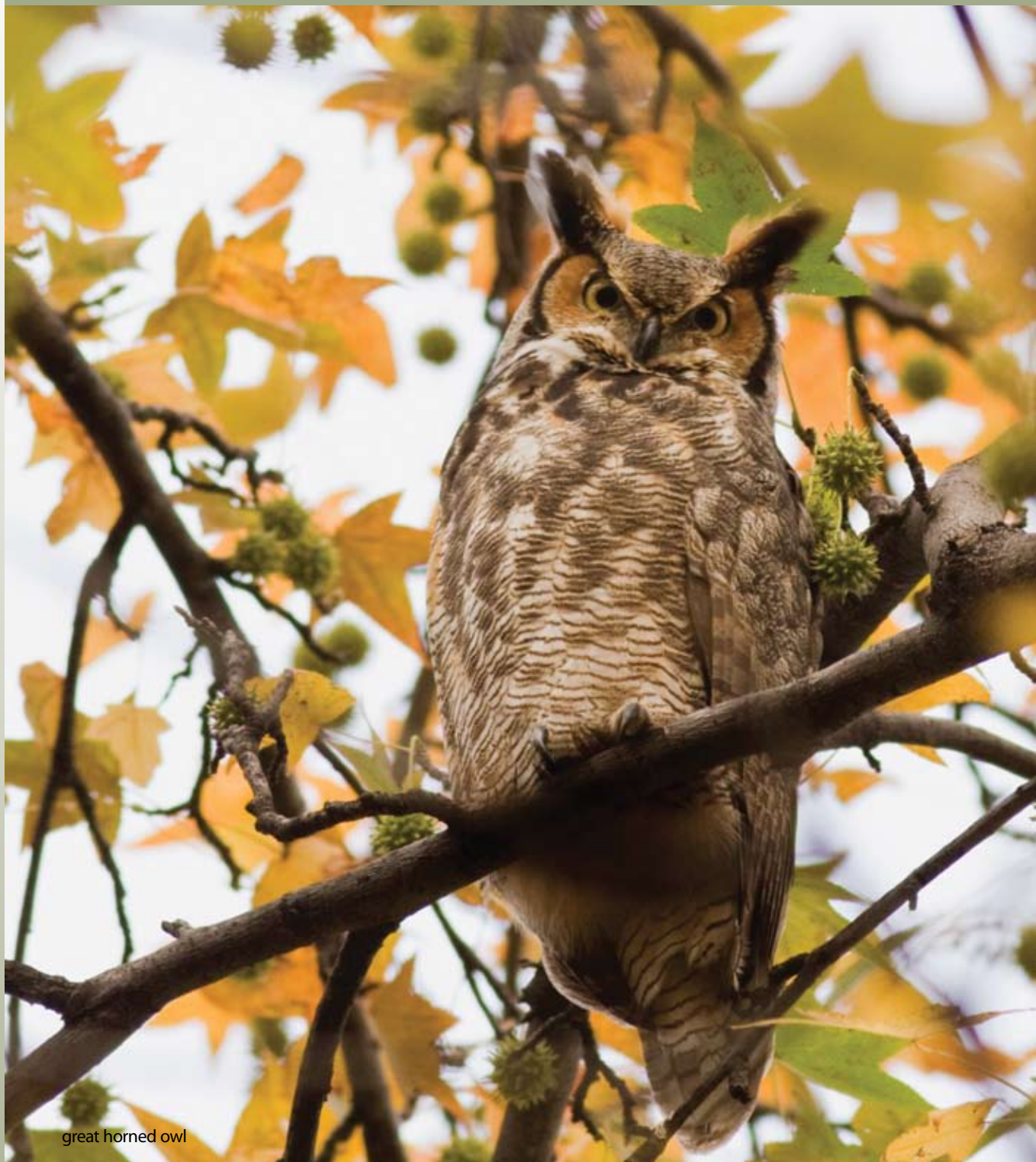
great horned owl

For natural history information about New York's owl species, check out DEC's pamphlet Owls of New York State at www.dec.ny.gov/pubs/4791.html and Cornell's All About Birds on-line bird guide at www.allaboutbirds.org/guide/search .