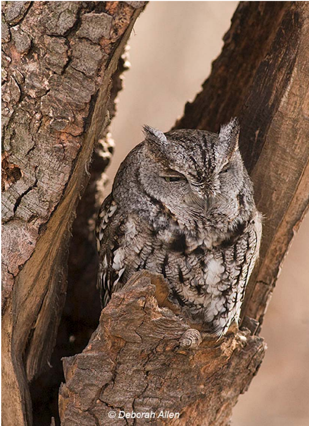
Eastern Screech-owl (grey morph) in Central Park on the morning of 27 March 2009.

For bird walks in Central Park and throughout NYC: