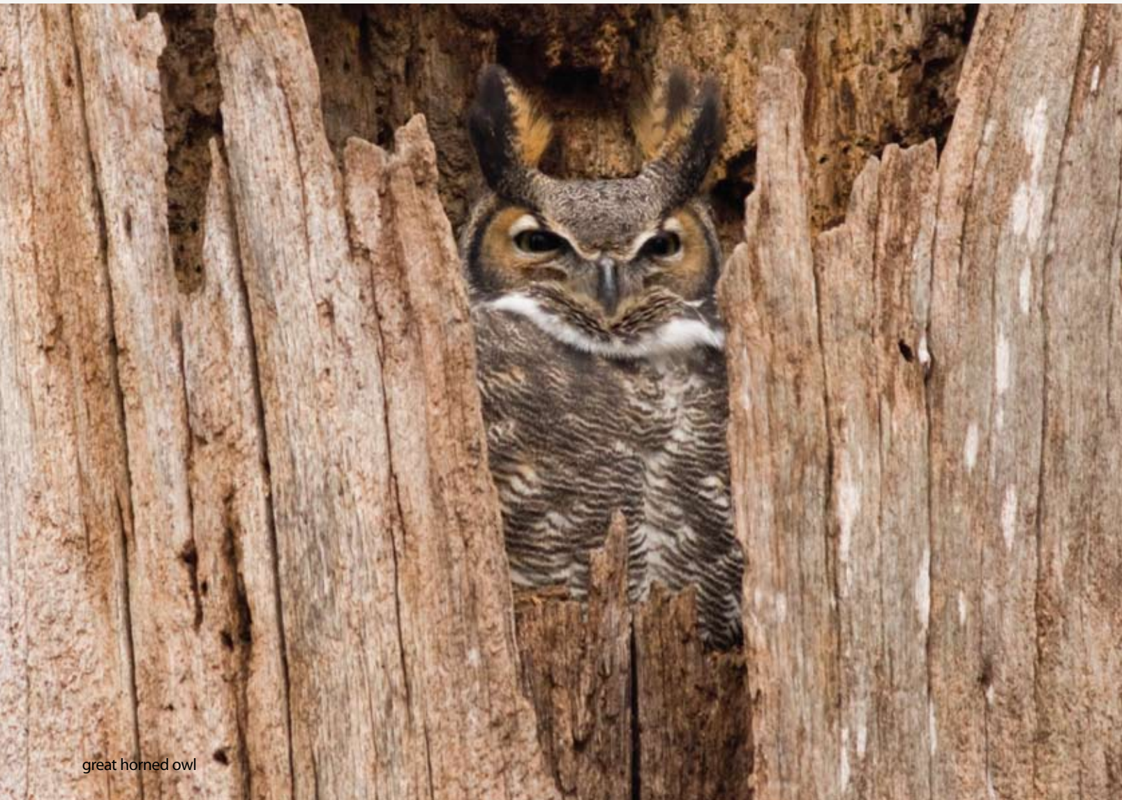
great horned owl