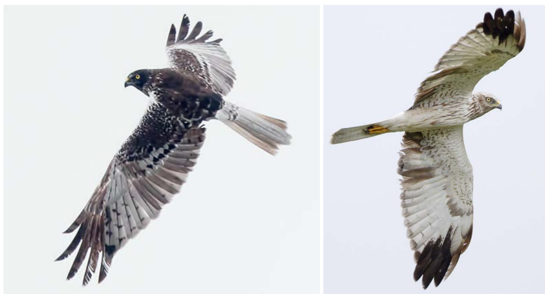
Eastern Marsh Harrier; Left : Adult male 23 September 2012; Right : 2 nd Year Male, 5 October 2011; Both – rdc