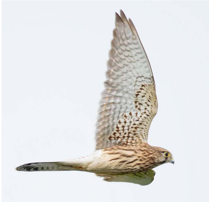
Eurasian (Common) Kestrel (juvenile female), 22 October 2012