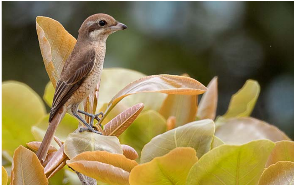
Brown Shrike; 26 September – rdc

Finally, there are many other migrants we see or catch in our nets at Khao Dinsor that do not fly past the watch site during the day. Sometimes these make an appearance in the nearby trees – the Brown Shrike (above) is the most obvious example. Andy Pierce, Chukiat Nualsri, Kaset Sutasha and Phil Round have banded individuals of the following species: Paradise Flycatcher (Light Morph), Eastern Crowned Warbler, Pale-legged Leaf Warbler, Plain-tailed Warbler, Yellow-rumped Flycatcher, Orange-bellied Flowerpecker, Siberian Blue Robin, Stripe-throated Bulbul and Crow-billed Drongo.