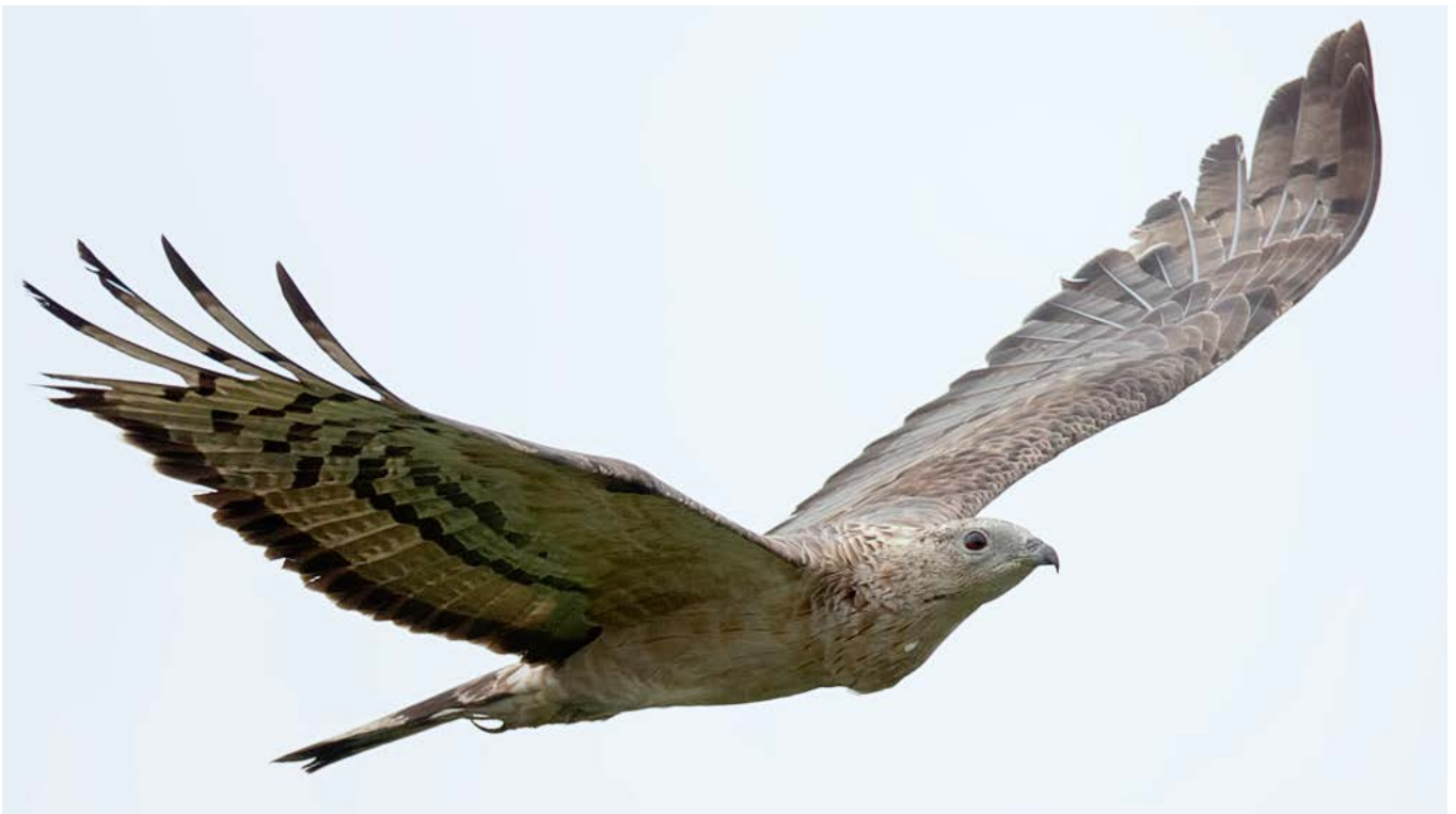
Oriental Honey-buzzard (adult male) with full crop, 25 September 2012 – rdc