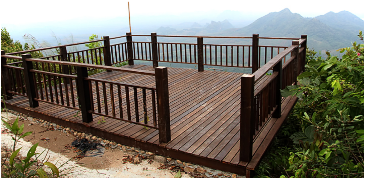
Khao Dinsor March 2013; view from the top (Shelter 5) looking north – Chukiat Nualsri