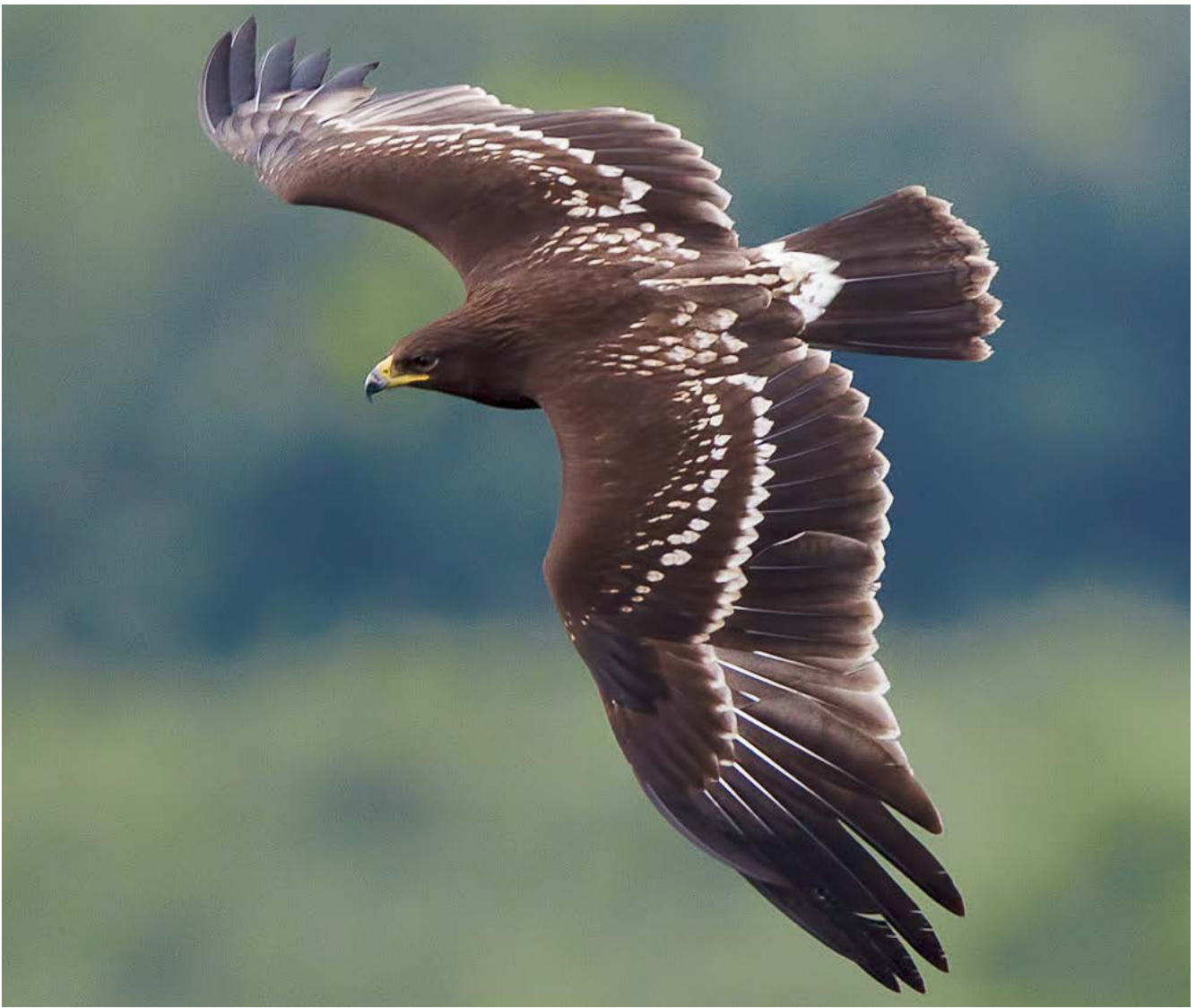
Greater Spotted Eagle [migrant] – juvenile; Oct 2011