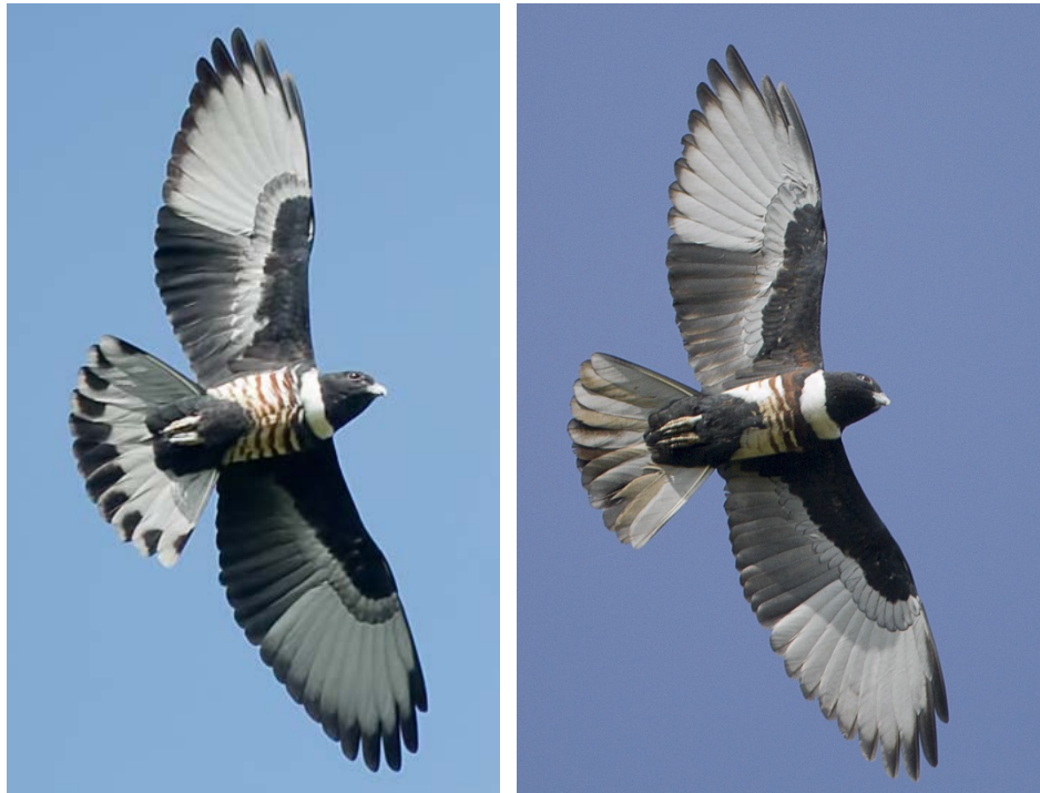
Black Baza; Left: adult female (26 October); Right: adult male (31 October 2011) – rdc

Much confusion exists in the literature regarding how to distinguish males from females. We have chosen a method developed in India: researchers determined by watching adults at a nest, the female (when looking up at her from below) had more red barring than the male. Others contend there is much variation in plumage... However, it is unusual to see a female-type bird (below left; see also photo bottom page 6) with such heavy, black markings on the distal portion of her tail, and the trailing edge of her wings. Is this a different subspecies? More photographic research is needed. The bird on the right might be a sub-adult male with that amount of chestnut-brown in the tail and secondaries.