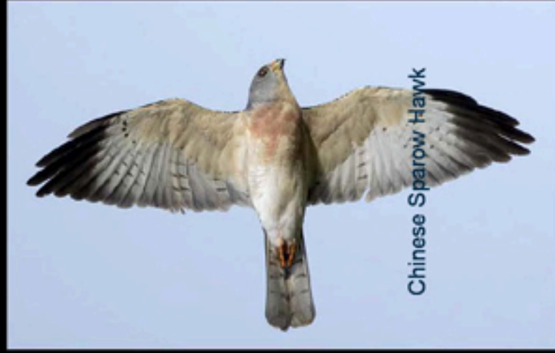
Chinese Sparrow Hawk