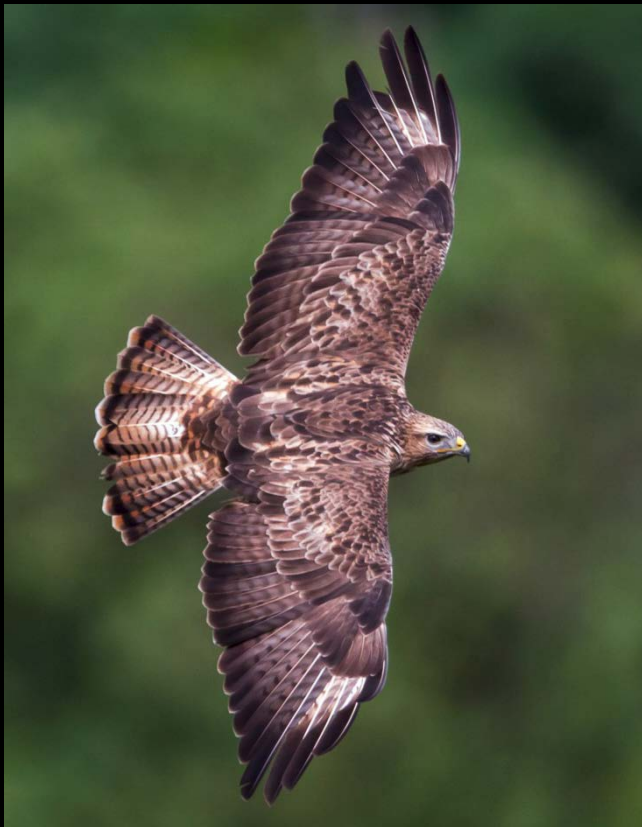
Steppe Buzzard ( Buteo b. vulpinus ), Migrant 5 October 2012