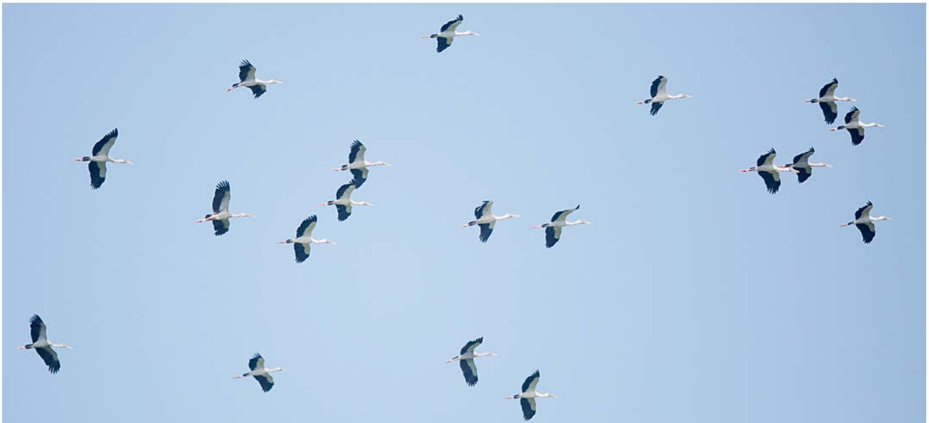
Open Bill Storks, 11 October – rdc

Early in the evening, 6:10pm (18h10) on 16 September, there was a major migration of Barn Swallows along the coast that was easily seen at nearby Thung Wua Laen Beach – most swallows were only a meter or two above the beach or adjacent South China Sea. A few thousand came through in 45 minutes. (These are not included in the 2012 Khao Dinsor count.) Several Japanese Sparrowhawks were also migrating and diving to catch (unsuccessfully) the migrating Barn Swallows. After approximately 6:45pm (18h45), with just a trace amount of light left, the Barn Swallows that had been migrating as lone birds, came together to form tight flocks – something I had never seen Barn Swallows do. Late that same evening (approximately 10:30pm; 22h30), Dr. Wanna Phatara-Atikom emailed me a photo (above) she had taken when she left her office in Chumphon City for the night. There were hundreds of Barn Swallows roosting in the parking lot of her hospital. Chumphon City is approx. 15km (9 miles) south from Thung Wua Laen Beach.