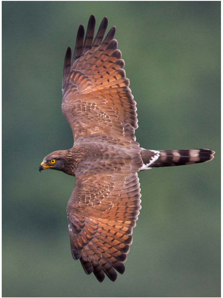
Top left: Grey-faced Buzzard (juvenile), 18 October – rdc Right: Grey-faced Buzzard (adult, likely male), 23 October – Martti Siponen