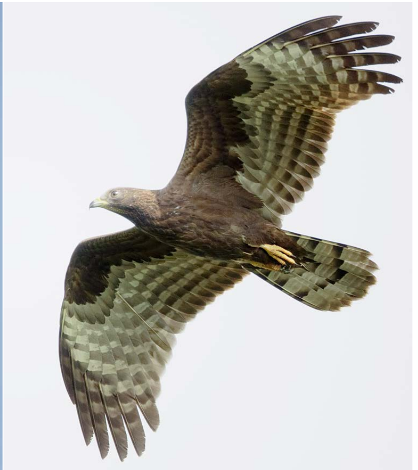
Oriental Honey-buzzard (juvenile), 19 October 2012 - rdc