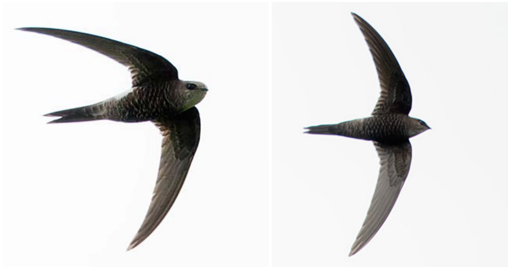
Left: Pacific Swift, 28 August; and Right: Pacific Swift, 29 August

Pacific Swift migration peaked in mid-September this year, while in 2011 the peak time frame was the last ten days of September. In 2012, two-thirds (68%) of the Pacific Swift flight occurred in the afternoon (after 12noon; from 12h00 to 18h00), while in 2011, 70% of the flight occurred in the afternoon. These are remarkably consistent results, suggesting that something is happening in the atmosphere that brings most Pacific Swifts to us after 12noon (12h00). By comparison, Needletail numbers (three species) were down by 15% from 2011. However, the peak flight time during the day was in the afternoon in both years – very similar to the Pacific Swift and Blue-tailed Bee-eater daily migration pattern. In all years, the White-throated Needletail (724) has been the most common species (in 2012, 93% of all needletails). The Needletails are sometimes seen in mixed species flocks with Brown-backed Needletail (6% of the Needletail flight) and very rarely a Silver-backed Needletail (1%), the other species we see on migration.