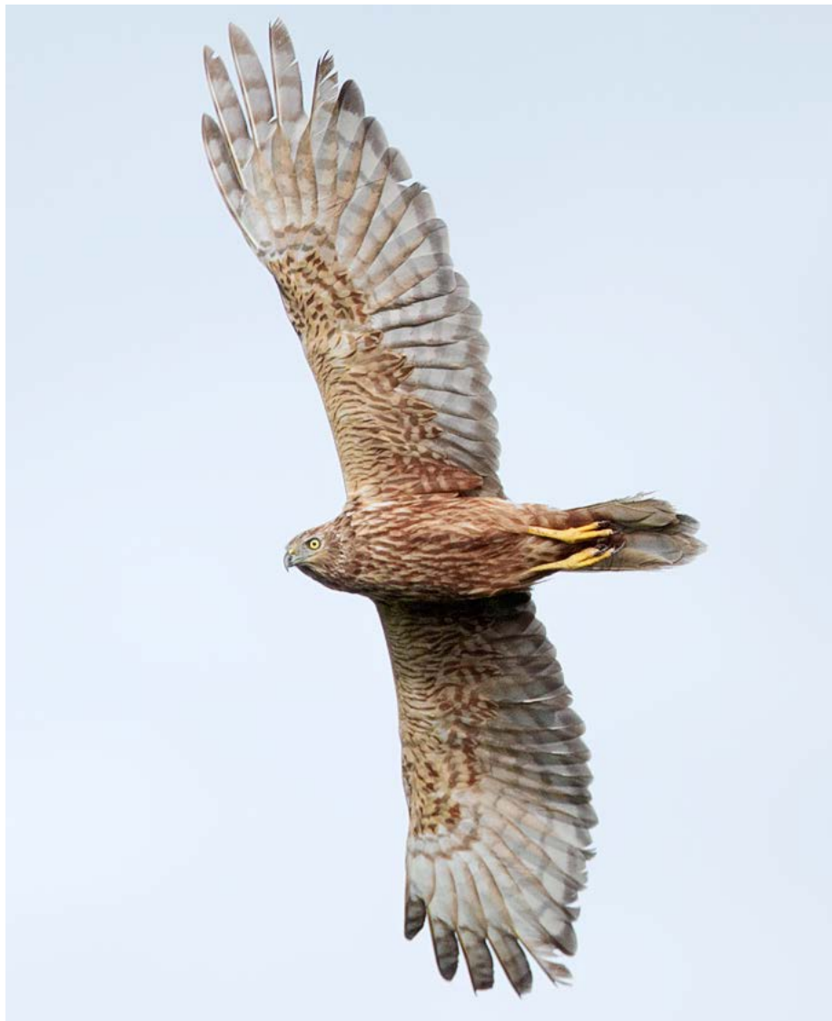
Eastern Marsh Harrier, adult female; 2 October – rdc