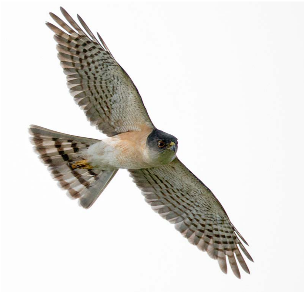
Japanese Sparrowhawk, adult male (17 September) – rdc