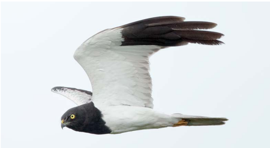
Pied Harrier (adult male); 4 Oct 2012