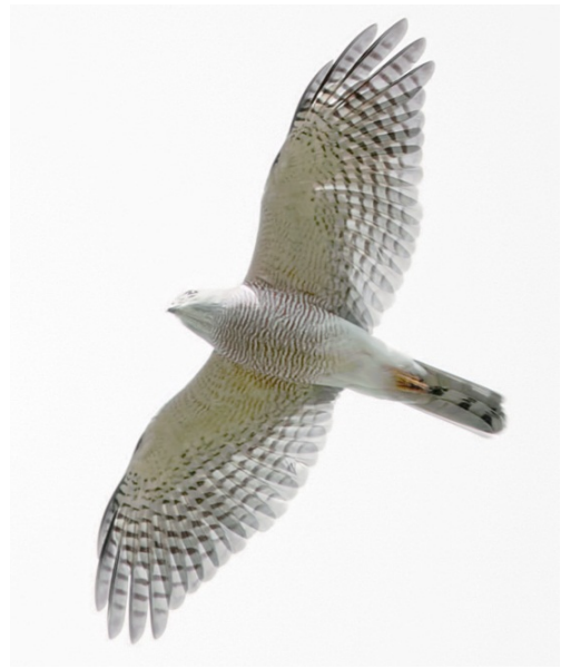
Shikra, adult male (15 Oct 2012) – rdc