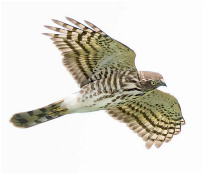
Besra, juvenile male (19 October 2012) - rdc