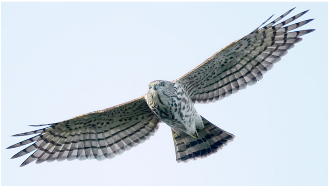
Shikra, juvenile; 11 October 2012 – Robert DeCandido PhD

So far we have not had much luck trapping the Shikra on migration – probably because the main migration period for this species is after 15 October – when winds slacken considerably. At this time, Accipiters tend to migrate higher over the ridge, because they have no need to use the ridge to block a headwind. However, we remain optimistic: with so many juveniles passing Khao Dinsor, at least a few must be very hungry and fly low and through the forest in search of prey...and end up in our nets. Late October seems to be the best time to see the two least common Accipiters at Khao Dinsor: the Besra and the Eurasian Sparrowhawk . In 2012 we took the first good photographs of juvenile Besra (see following page). However, the Eurasian Sparrowhawk remains elusive – we do think they are more common than our numbers to date (about five per year) indicate.