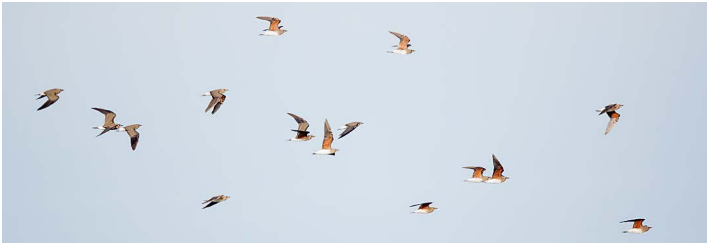
Oriental Pratincole Flock; 28 October 2012 – rdc

Khao Dinsor correctly receives recognition as a Raptor Migration Watch Site of global significance. However, attention is steadily increasing on the “other” bird species that migrate through this area. The data we are collecting for many species including the drongos, swifts, needletails, swallows, minivets, herons and others – are the first such information in South-east Asia, and for most of these, the first information from the Oriental region. See Table 2, page 7 for more information.