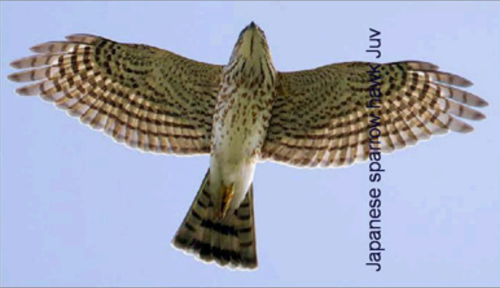
Japanese sparrow hawk Juv