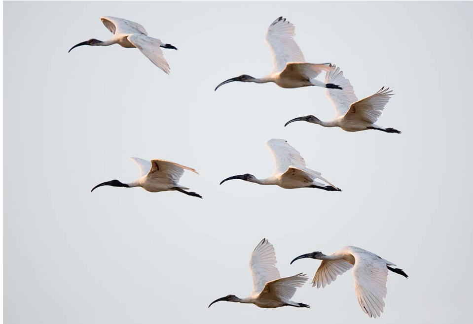
Black-headed Ibis; 19 January 2013 (seen at Khao Dinsor on 25 October)

Other migrants of note at Khao Dinsor in autumn 2012 include Open Bill Storks (photo previous page, bottom). The stork flight was exceptional this year (1,321), and it is no wonder why our colleagues in Malaysia started reporting large numbers of Open Bills by November 2012. Previous counts of Open Bill Storks at Khao Dinsor were 38 (2010) and 49 (2011). This species is on the increase in South-east Asia. Interestingly, until the 1980s Open Bill Storks migrated in largest number from east to west across South-east Asia to winter in Sri Lanka. By the late 1980s, with the introduction of a non-native wetland snail (the Apple Snail), Open Bill Storks increased in number throughout South-east Asia – and now migrate predominantly north to south. In 2012 we added a new wetland species to the list of migrants seen at Khao Dinsor: on 25 October a flock of 18 Black-headed Ibis (below) passed to the east of Shelter 2, and they were immediately identified by an excited Annika Forsten and Antero Lindholm of Finland.