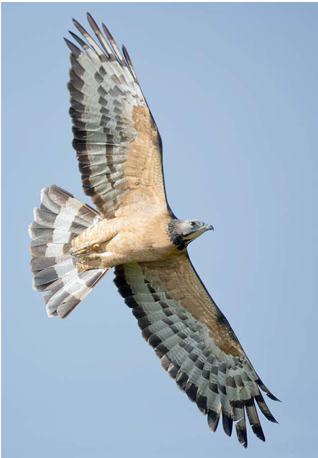
Oriental Honey-buzzard (adult male), 5 October 2012