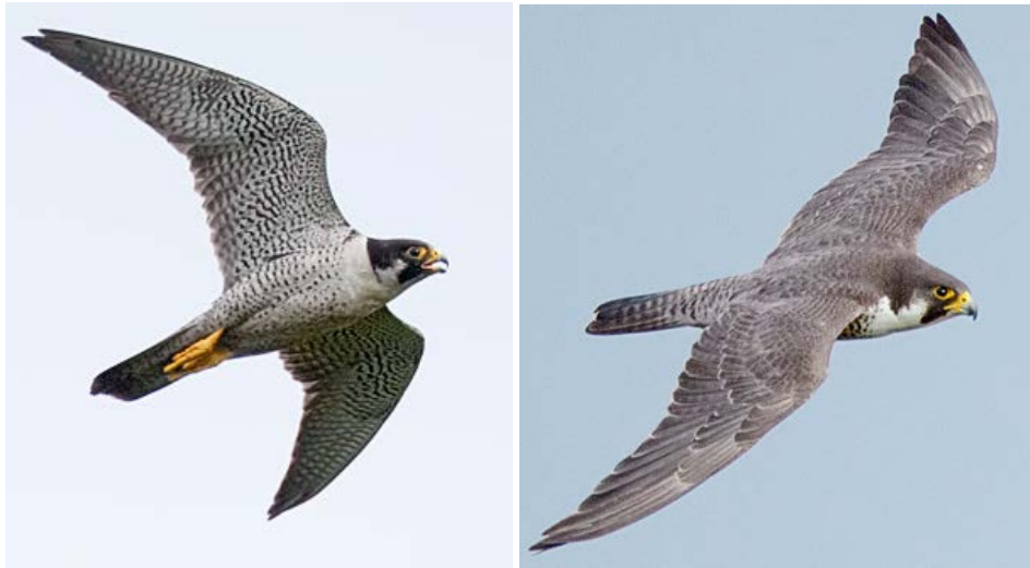
Peregrine Falcon ssp. japonicus (both adults and probably females), 30 Sep (left) and 1 October (right) – rdc

In 2012, we observed four migrant falcon species as we did in 2010-11. We show two below, the Peregrine Falcon ssp. japonicus , and the Eurasian Kestrel . In the three years of this count, we have not yet seen the Oriental Hobby , which should be a resident in this area. Eurasian Hobby was only seen in early November this year, later than in 2010-11, when the first ones were seen in mid- to late October. Our Amur Falcon numbers were exactly the same as last year (4). However, our Peregrine numbers were 60% lower than in 2011 (17, compared to 44 in 2011).