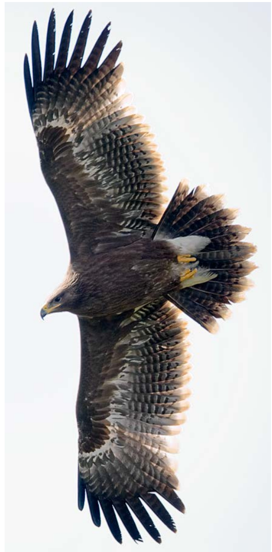
Above Left: Bonelli's Eagle (3 rd - 4 th plumage), 27 Nov (Nepal) – rdc; and Right: Steppe Eagle (2 nd - 3 rd plumage), 24 Nov (Nepal) – rdc; both are migrant species at Khao Dinsor

Note: not all raptor migration occurs from north to south in the Far East. There is a major east to west autumn migration route as well.