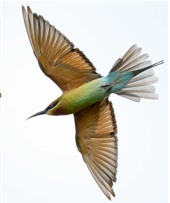
Left: Blue-throated Bee-eater (sub-adult); 20 August; and Right: Blue-tailed Bee-eater; 26 September – both rdc

Bee-eaters continue to interest us. In 2012 we discovered that the Blue-throated Bee-eater migration begins by mid-August, and possibly by late July. On 20 August we photographed (above left) a sub-adult Blue-throat which was not in juvenile plumage, nor complete adult plumage. This transitional (second-year) plumage is not described in the literature so far as we are aware. By comparison, the Blue-tailed Bee-eater migration begins later in the season, peaking later than the Blue-throated migration. The almost 27,000 Blue-tails we counted this year are the highest total to date. It is the rare exception when we see a Blue-tail mixed into a Blue-throat flock or vice-versa. Finally, in 2012 we tallied our highest number of Chestnut-headed Bee-eaters (144) – this species peaks in late October through early November each year.