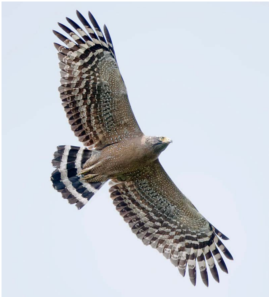
Adult Crested Serpent Eagle (14 Oct 2012) – rdc