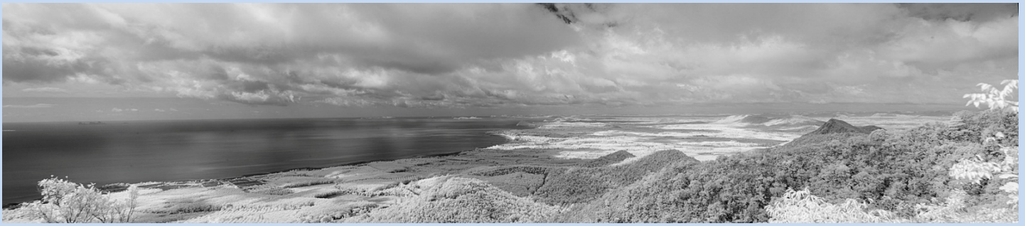
View looking southeast from Khao Dinsor in Infra-red, 17 August 2012