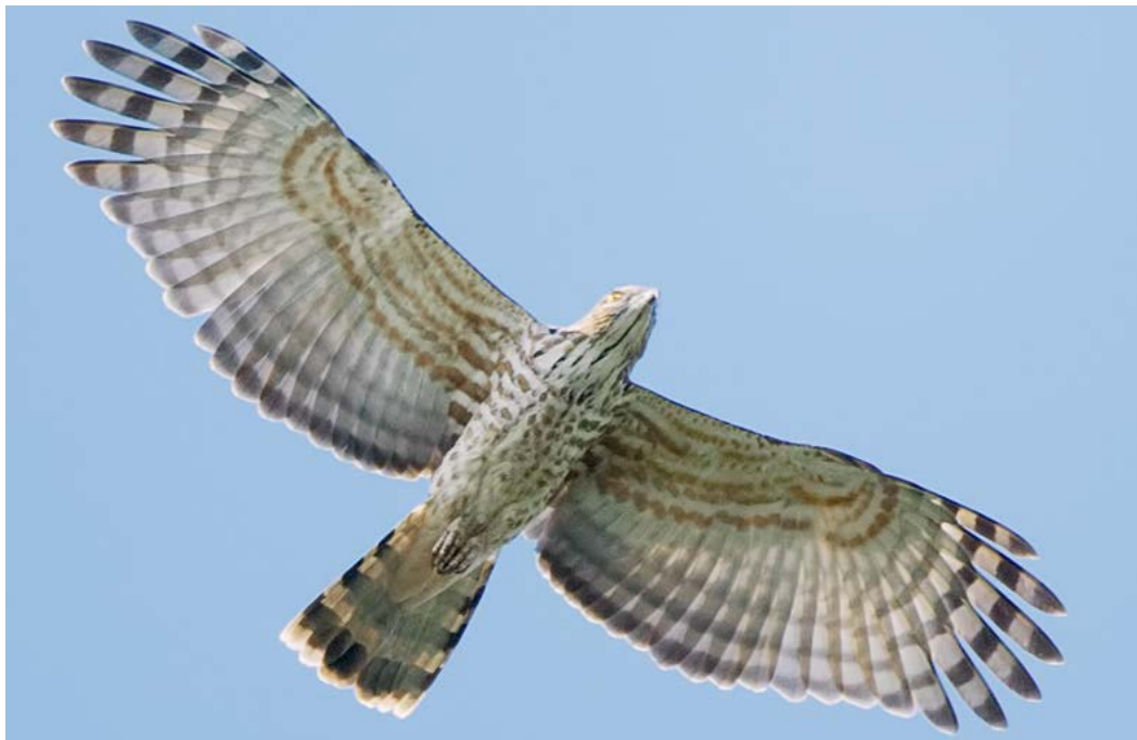
Jerdon's Baza, juvenile male (27 October)

This was also a banner year for Jerdon's Bazas – we counted 192, which is more than double the 2011 total (78), and almost ten times(!) as many as we counted in 2010 (20). In 2010-2102, the Jerdon's Baza flight has always started after 21 October, and peaked in the last few days of October into early November.