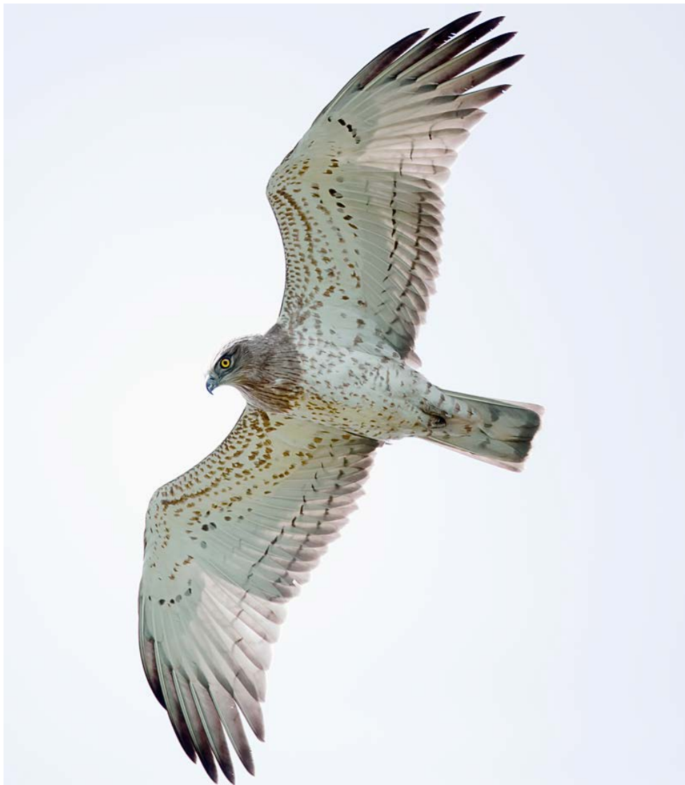
Short-toed (Snake) Eagle; 3 rd to 4 th plumage [migrant]; 29 Oct – rdc