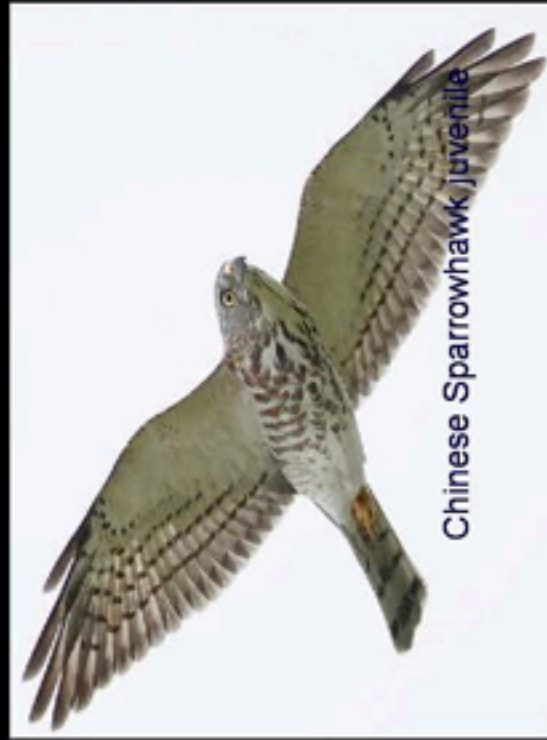
Chinese Sparrowhawk juvenile