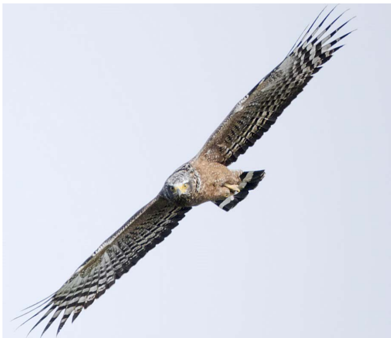
Crested Serpent Eagle, Juvenile (20 October 2012) – rdc

We saw three Short-toed Snake Eagles in 2012 – and at least one was an older bird (photo page 11). Typically these eagles come through quite low, sometimes just over the tree-tops. Of Booted Eagles , we have seen 70 to 75 each season of our three years of counting. The 2012 count was 74. These eagles will also migrate close to tree-top level (photo p. 12), and the dark morphs closely resemble Black Kites. Greater Spotted Eagles (photos p. 9) are uncommon to rare migrants in the area. From 2010-11 we saw 20 each year; in 2012, we counted 11. Martti Siponen's wonderful photo of a juvenile (first fall) Greater Spotted Eagle is from a unique perspective: from above looking down on the bird. Note the smooth white trailing edge of the wings (meaning all secondaries and primaries are the same age), and the ample spotting on the back – characteristic of a juvenile.