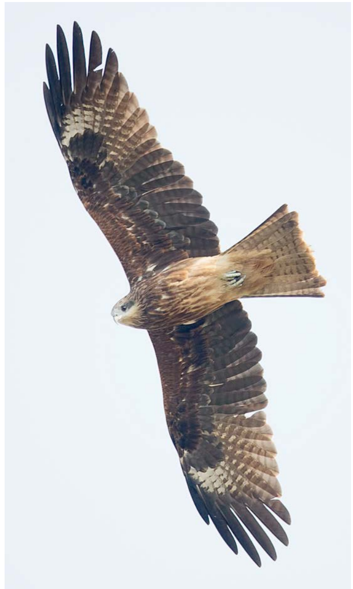
Top left: Black-eared Kite ssp. lineatus (1 st – 2 nd plumage), Petchaburi (Thailand), 18 January 2013 – rdc Right: Black-eared Kite ssp. lineatus (almost adult), Petchaburi (Thailand), 19 January 2013 – rdc

The problem has been how to distinguish between the two (sub)species? Reading the different field guides to birds in the region from India east to the Thai-Malay peninsula, left us perplexed...some books had fine descriptions but the accompanying visuals were lacking – or vice versa. This year we had the opportunity to photograph both the Black-eared Kite and the Pariah Kite in multiple locations in Thailand and Nepal. And we can report that it is not always possible to separate the two in the field, especially of flying birds. There is overlap in some plumage characters. However, digital photography really helps the identification process...and by selecting individuals toward the extremes, we came up with the following guidelines: