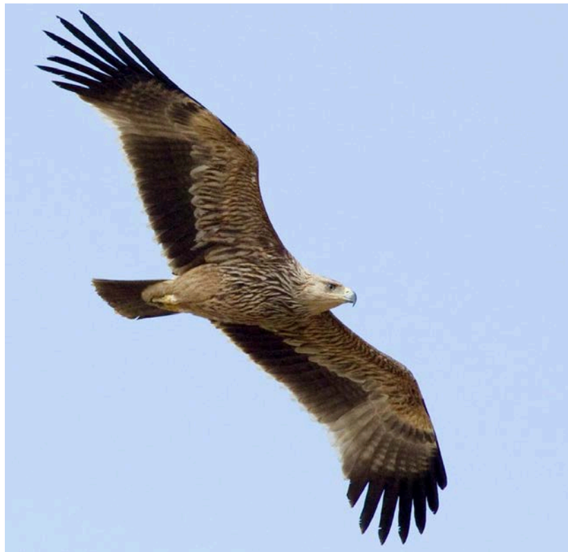
Imperial Eagle [migrant]; juvenile – January 2013 at Petchaburi (Thailand) Col. Nattapol Kirdchuchuen

We saw three Short-toed Snake Eagles in 2012 – and at least one was an older bird (photo page 11). Typically these eagles come through quite low, sometimes just over the tree-tops. Of Booted Eagles , we have seen 70 to 75 each season of our three years of counting. The 2012 count was 74. These eagles will also migrate close to tree-top level (photo p. 12), and the dark morphs closely resemble Black Kites. Greater Spotted Eagles (photos p. 9) are uncommon to rare migrants in the area. From 2010-11 we saw 20 each year; in 2012, we counted 11. Martti Siponen's wonderful photo of a juvenile (first fall) Greater Spotted Eagle is from a unique perspective: from above looking down on the bird. Note the smooth white trailing edge of the wings (meaning all secondaries and primaries are the same age), and the ample spotting on the back – characteristic of a juvenile.