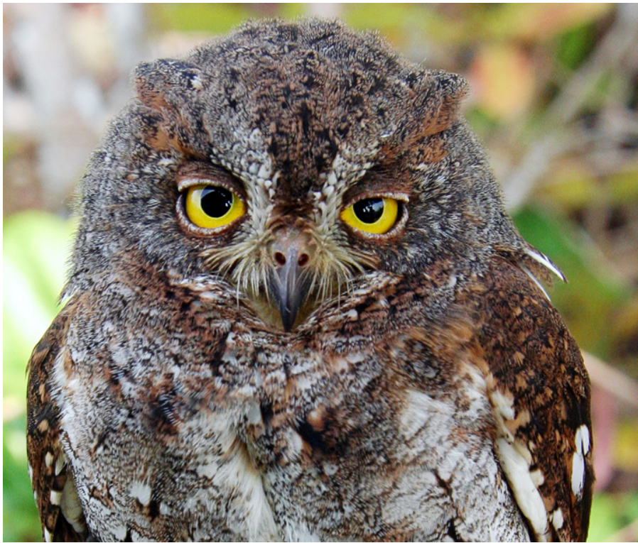
Oriental Scops Owl (Rufous Morph); 16 October 2012 – Kaset Sutasha DVM