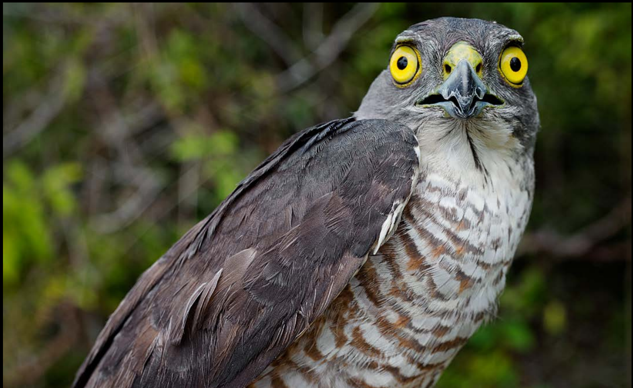
Japanese Sparrowhawk; Adult Female; 18 September 2012; Robert DeCandido PhD