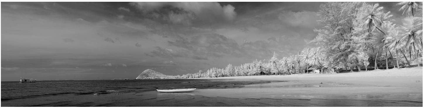
Thung Wua Laen Beach approx. 6km from Khao Dinsor, 8 August 2012