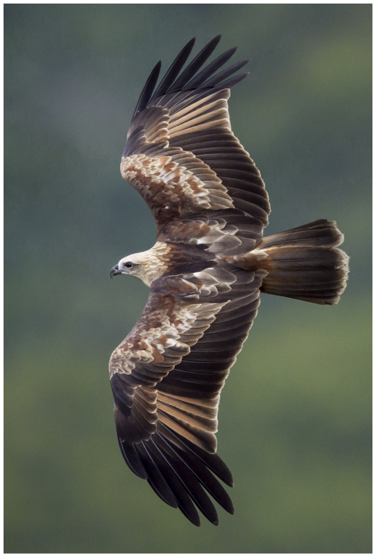
Left: Brahminy Kite (juvenile), 19 Jan 2013, Petchaburi (Thailand) Right: Brahminy Kite (juvenile), 6 Oct 2012, Khao Dinsor

Brahminy Kites migrate through this part of South-east Asia in small number – we average somewhere between 13 and 25 each season. They sometimes pass close to the ridge at Khao Dinsor (photos pages 16-17).