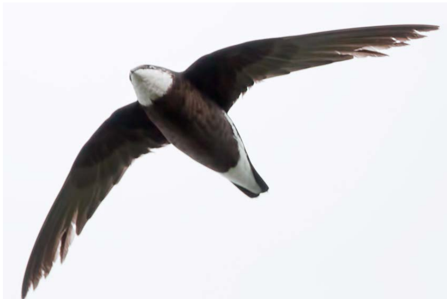
White-throated Needletail; 1 October – rdc