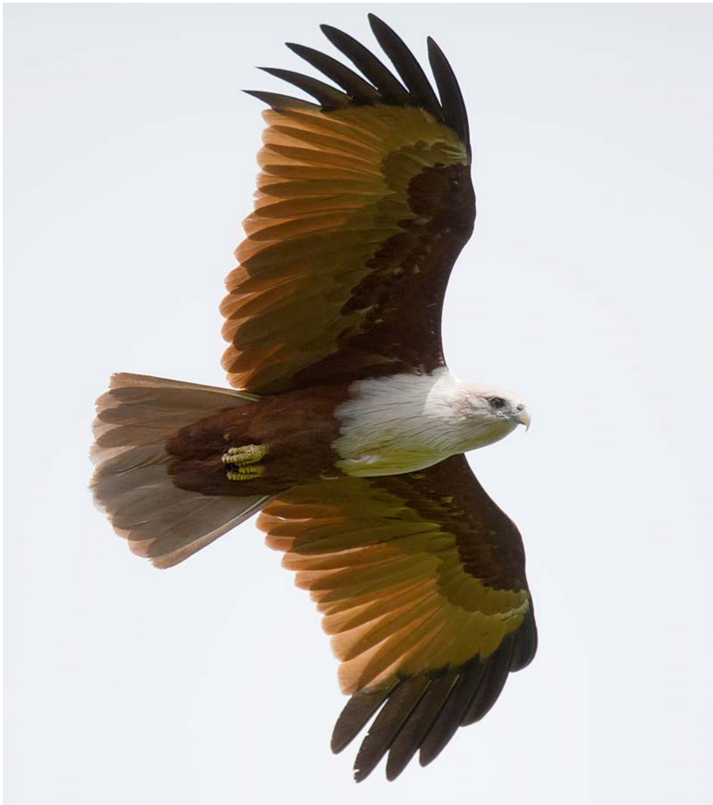
Brahminy Kite (adult), 25 August - rdc

There are two species (or sub-species depending upon which taxonomy one follows) of Black Kite in this area: the northern Black-eared Kite Milvus migrans ssp. lineatus ; and the Pariah (Black) Kite , Milvus migrans ssp. govinda . To date at Khao Dinsor, we have only seen Black-eared Kites ( lineatus ) on migration. However, just north of us at the Rice Fields near Petchaburi, there are a number of Pariah Kites ( govinda ). And in our research in Nepal, we have seen Pariah Kites migrating east to west – so we know that this (sub)species migrates in small numbers in at least part of its range.