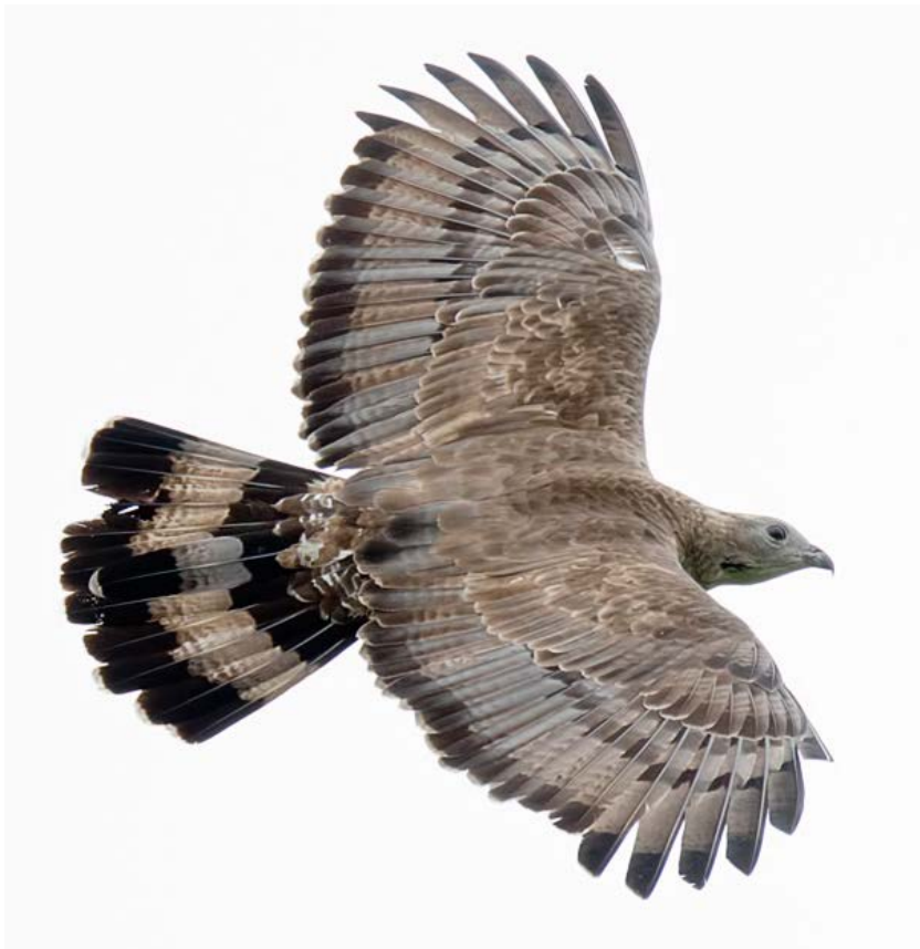
Oriental Honey-buzzard (adult male), 29 September 2012 – rdc