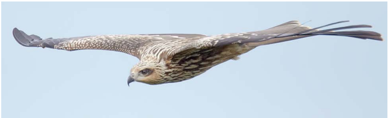
Black-eared Kite (ssp. lineatus ); juvenile – showing the black “ear” on light head; 4 October (Khao Dinsor) – rdc

There are two species (or sub-species depending upon which taxonomy one follows) of Black Kite in this area: the northern Black-eared Kite Milvus migrans ssp. lineatus ; and the Pariah (Black) Kite , Milvus migrans ssp. govinda . To date at Khao Dinsor, we have only seen Black-eared Kites ( lineatus ) on migration. However, just north of us at the Rice Fields near Petchaburi, there are a number of Pariah Kites ( govinda ). And in our research in Nepal, we have seen Pariah Kites migrating east to west – so we know that this (sub)species migrates in small numbers in at least part of its range.