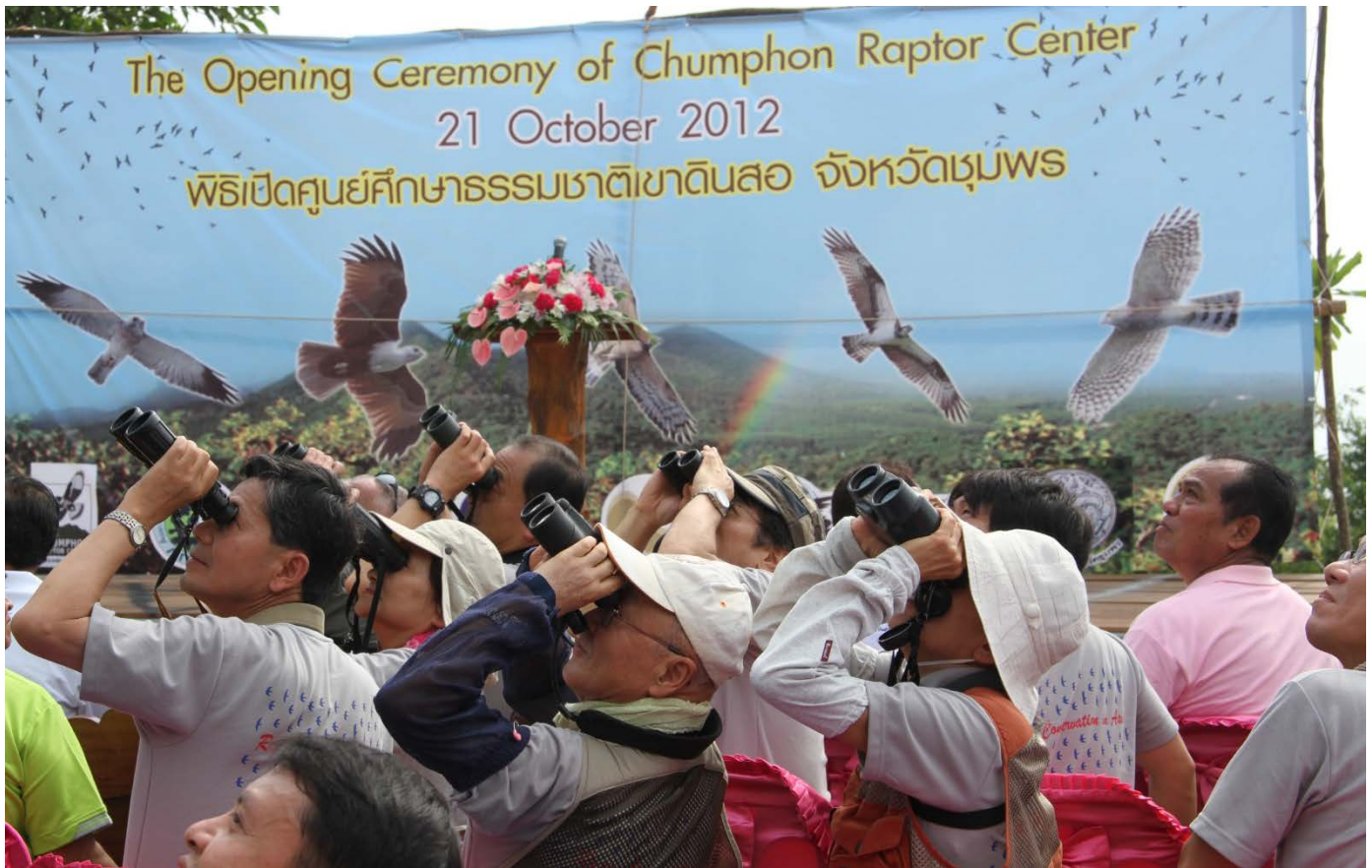
Everyone turned to watch as a Booted Eagle passed overhead at the Opening Ceremony, 21 October

The Chumphon Raptor Research and Education Center was completed in late summer 2012. On Sunday, 21 October 2012, the Center was officially opened to the public. Guests came from all parts of Thailand, Indonesia, Malaysia, Taiwan, Japan, the Philippines and as far away as North America. Below and on the following page, are a series of photos by Chukiat Nualsri showing some of the visual highlights of the complex and related facilities including two new (February 2013) observation platforms at Shelter 2 (bottom p.45) and another at the very top of Khao Dinsor (photo p.47); below left (bottom) shows the presentation of a Buddha statue in honor of Nurak Israsena.