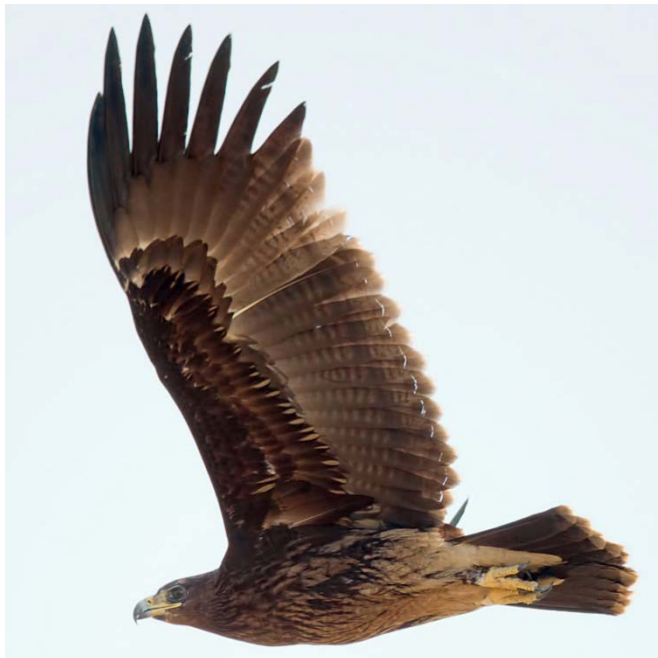
Greater Spotted Eagle [migrant] 19 Jan 2013 (Petchaburi, Thailand)