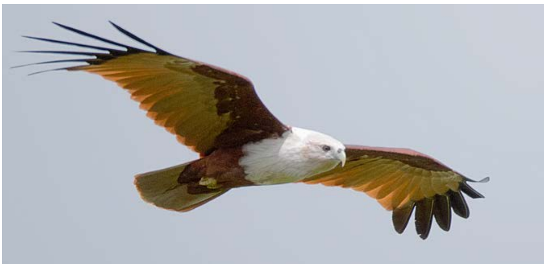
Brahminy Kite (adult), 25 August - rdc

Brahminy Kites migrate through this part of South-east Asia in small number – we average somewhere between 13 and 25 each season. They sometimes pass close to the ridge at Khao Dinsor (photos pages 16-17).