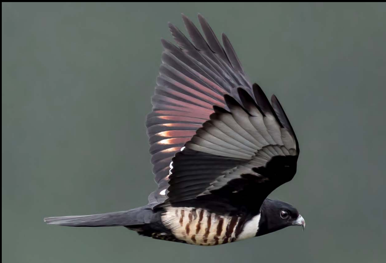
Black Baza (female), Migrant; 25 October 2012