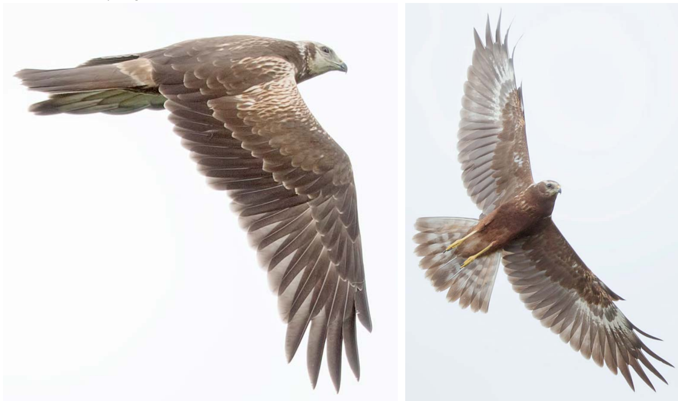
Eastern Marsh Harrier; Left : juvenile female (25 September); Right : juvenile (7 October); Both – rdc

Harriers present difficult identification challenges, particularly individuals in juvenile through sub-adult plumage. Below we present several plumages showing different ages and sexes of the Eastern Marsh Harrier. In flight, Eastern Marsh Harriers are noticeably larger than Pied Harriers.