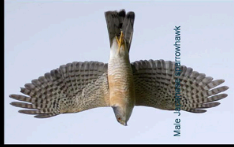
Male Japanese Sparrowhawk