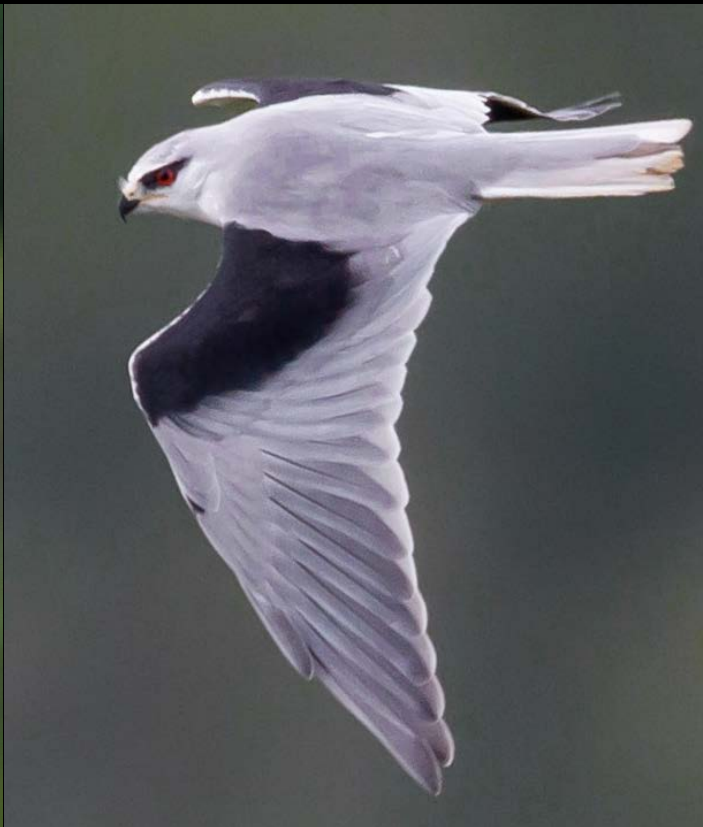
Black-shouldered Kite, 5 October 2012, Local Resident 5 October 2012