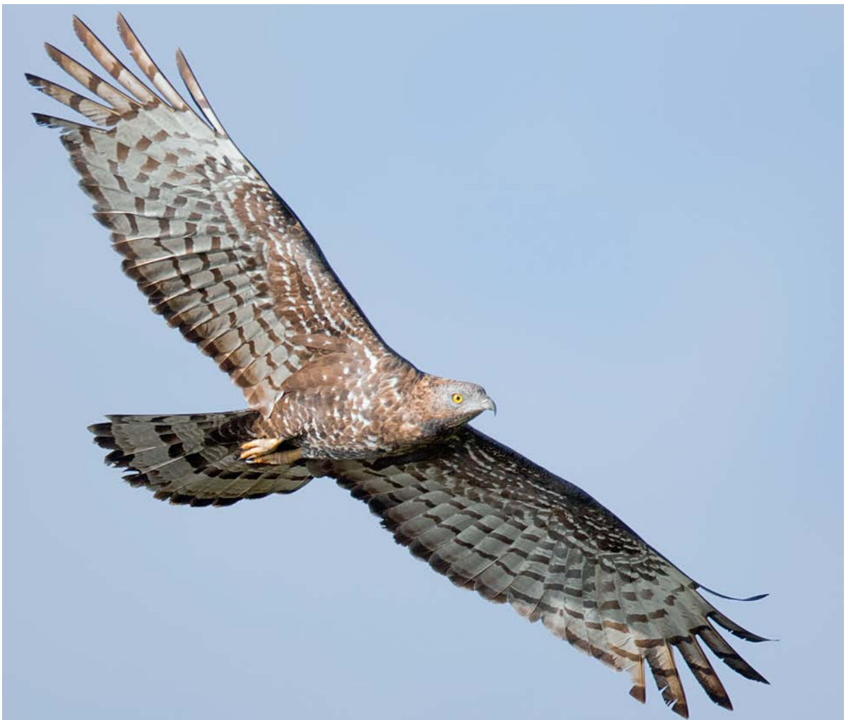
Oriental Honey-buzzard (adult female), 5 October 2012 – rdc