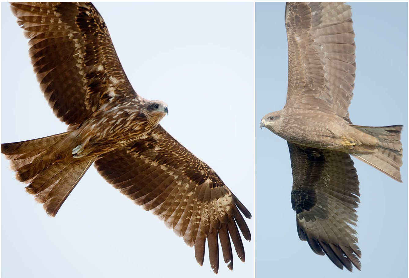
Top left: Black Kite ssp. govinda (juvenile), Petchaburi (Thailand), 18 January 2013 – rdc