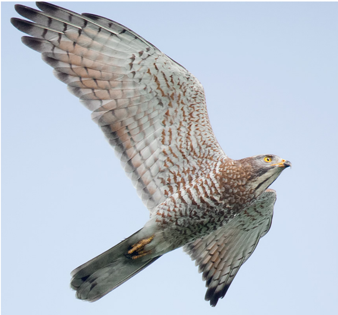
Grey-faced Buzzard (adult), 18 October – rdc

While we see many Oriental Honey-buzzards on migration with a full crop, we have yet to see a single GFB with a full crop as these raptors pass us at Khao Dinsor. Below and on the following page, we present photographs of juveniles and adults. Martti Siponen's photo of an adult (looking down from above) shows how strikingly handsome this bird is in flight (see p. 21, top right).