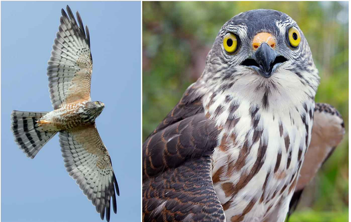
Left: Chinese Sparrowhawk, juvenile, likely female (3 October); Right: Chinese Sparrowhawk, juvenile (20 September)