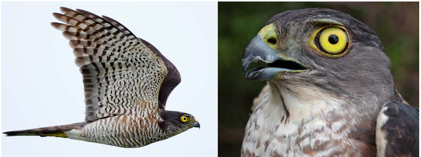
Japanese Sparrowhawk, adult females (Left: 18 September; Right: 20 September) – rdc

The timing of Chinese Sparrowhawk, Japanese Sparrowhawk and Shikra migration has been remarkably consistent in 2010-12. Chinese Sparrowhawks peaked in late September through early October, while Japanese Sparrowhawks peaked from about 10 September through 10 October. Shikra migration peaked from approx. 15 October through early November. On a daily basis in 2010-2012, Sparrowhawk migration occurred throughout the day: 50% of the Japanese Sparrowhawk and Shikra flight occurred from 12noon through 6pm (12h00 to 18h00), while 40% of the Chinese Sparrowhawk flight occurred in the afternoon – probably because some flocks got so high we could not accurately count them. This pattern is very different than the Black Baza and Grey-faced Buzzard migration – more than 80% of the Black Baza flight (and > 90% of all Grey-faced Buzzards) were counted before 12noon (12h00) in 2010-2012.