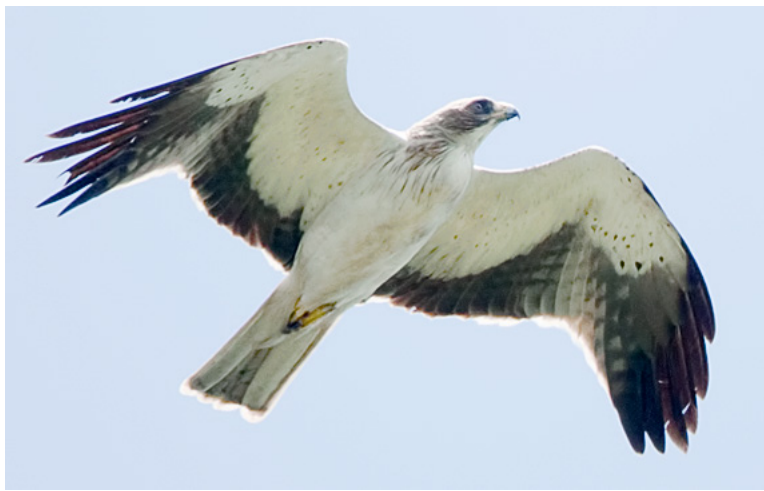
Booted Eagle (light morph), 28 Oct – rdc; migrant and winter resident in the area