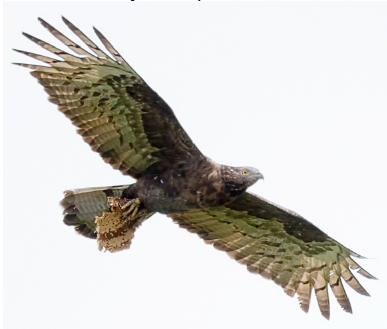
Oriental Honey-buzzard (adult female), with honey-comb; 30 September – rdc

We saw approximately the same number of Oriental Honey-buzzards ( Pernis ptilorhynchus orientalis ) in autumn 2012 (33,835) as 2011 (36,399), and autumn 2010 (32,870). Two-thirds (67%) of this migration takes place from 9am through 1pm (09h00 to 13h00). Up to 3% of the Oriental Honey-buzzards (OHBs) passing Khao Dinsor have a full crop (photo top p. 14) – or are carrying food with them. In 2012 we again photographed an OHB carrying a honey-comb on migration (photo below). OHBs primarily eat the bee/wasp larvae in these combs. Beginning at first light, these large raptors are likely using the early morning hours to hunt for rodents in the endless agricultural forests of Oil Palm in the area. Once the first strong thermals begin rising at about 8:30am (08h30), the OHBs begin their migration for the day. For the entire season during 2010-2012, peak migration time has always been in early October for this species. Adults (pages 14-15) precede juveniles (p. 15, top right). We see very few juveniles (= first year birds) each autumn, but more second-year birds. Later in the season, the primary migration time of juveniles, they seem to use a different (inland) route several kilometers to our west, particularly once winds have switched to NE.