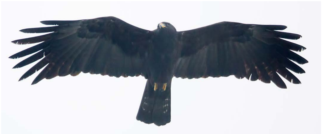
Black Eagle (adult), 10 November (Nepal) – rdc; very rare resident in the area of Khao Dinsor