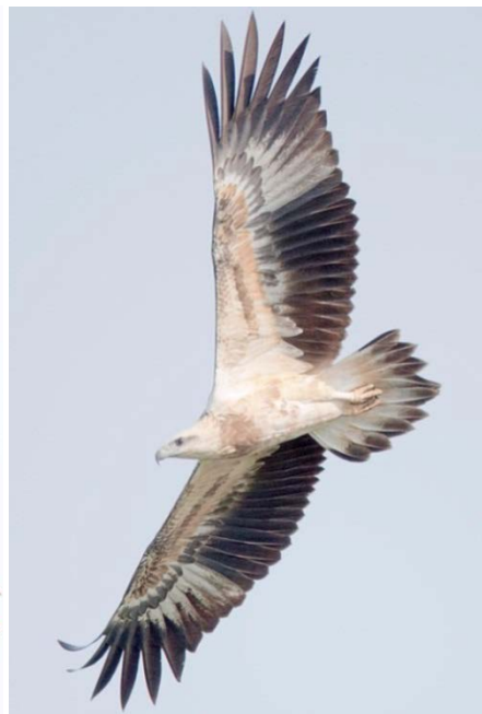
Above Left: Changeable Hawk-eagle (dark morph), Singapore; and Right: White-bellied Sea-eagle (juvenile/1 st plumage), 13 Oct; both are resident species