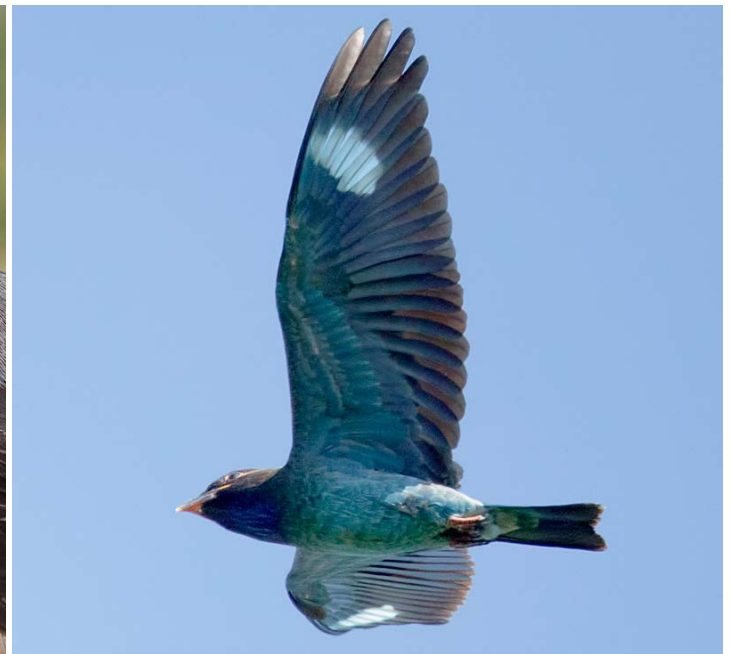
Left: Ashy Minivet (adult female); 16 October; and Right: Dollarbird; 10 October