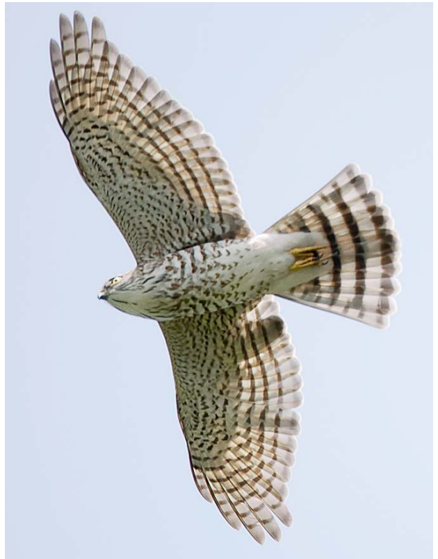
Japanese Sparrowhawk, juvenile females ( Left : 20 September; Right : 18 October) – rdc