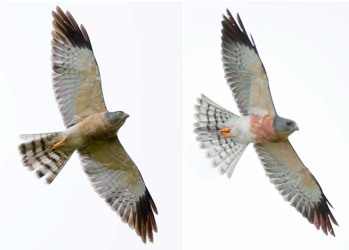
Left: Chinese Sparrowhawk, adult female (15 September); Right: Chinese Sparrowhawk, adult male (7 October) – rdc