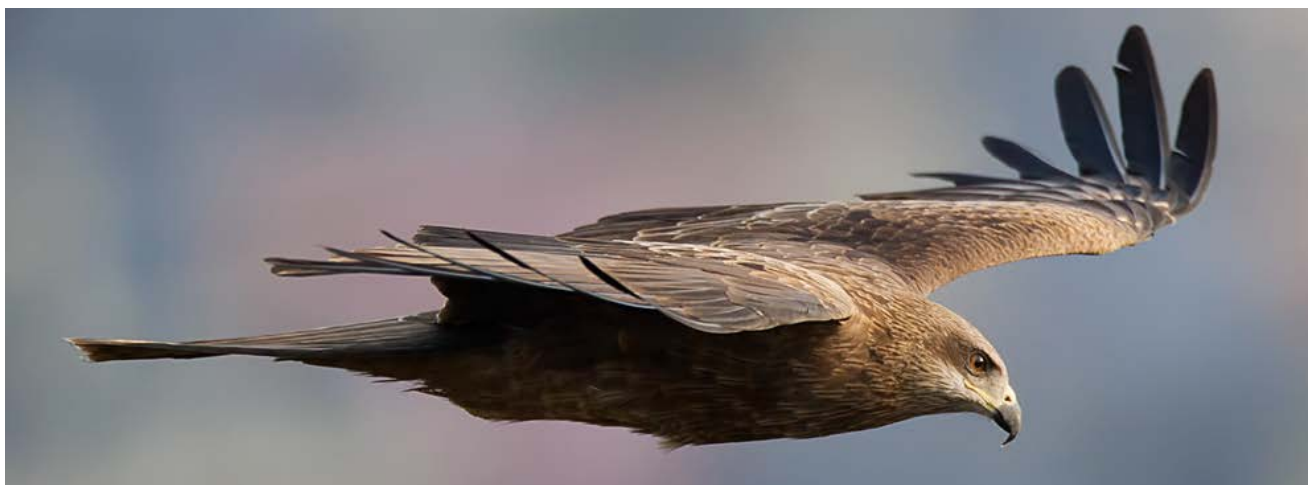
Black Kite ssp. govinda (adult), Kathmandu (Nepal), 7 December 2012

Compared to the Black-eared Kite ( lineatus ) photos shown on the previous page, the Pariah govinda Kite shows the following characters when photographed in good, even light: (a) there is no distinct plumage difference between the upper half of the body and the vent area – it is uniformly dark; (b) the white streaking on the body of juveniles is thinner than on lineatus ; (c) the white patch at the base of the primaries is small – and often marked with barring or streaking; (d) in older birds, the feet and cere are a lovely golden yellow in color (above right photo); however, caution! Because the cere and feet reflect light...and in Thailand, the light is very strong: not every photo shows this character well – caution must be used. In many photos we have taken, the feet and cere are overexposed – and look white (“burned out”). Finally (e), in flight, govinda can show a more lunate (forked) tail – but since kites twist and turn so often in flight, this is a less useful character.