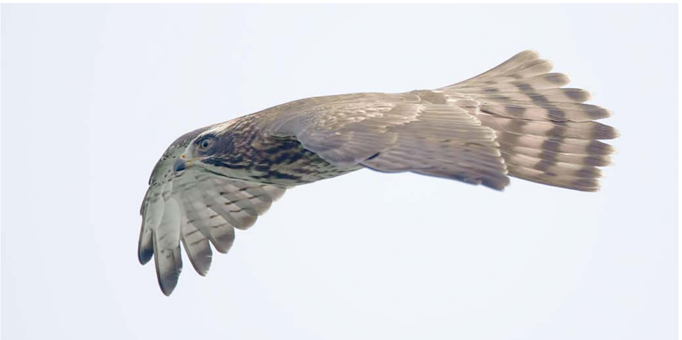
Grey-faced Buzzard (juvenile), 18 October – rdc