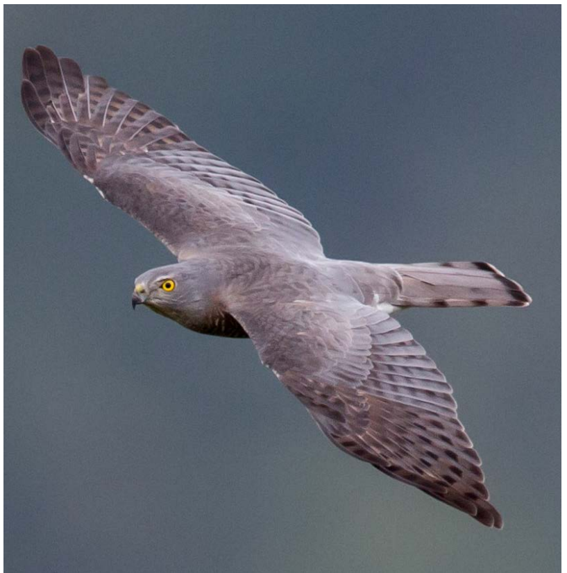
Shikra, adult female [both images]; left: 25 September 2012 – rdc; Right: 2 October 2012 – Martti Siponen