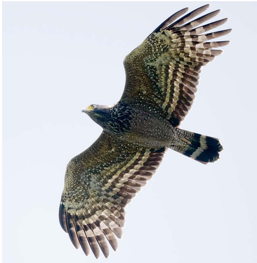
Cover photo: Crested Serpent Eagle, Juvenile (20 October 2012); Above: Juvenile Crested Serpent Eagle (16 October 2012)

In October 2012, we lost a great man who supported the arts and sciences in Thailand, Khun Nurak Israsena (1929-2012). On pages 39 – 43, there is a wonderful story about Nurak Israsena and Edmund Pease (Nurak's partner for more than 50 years), written by Philip D. Round.