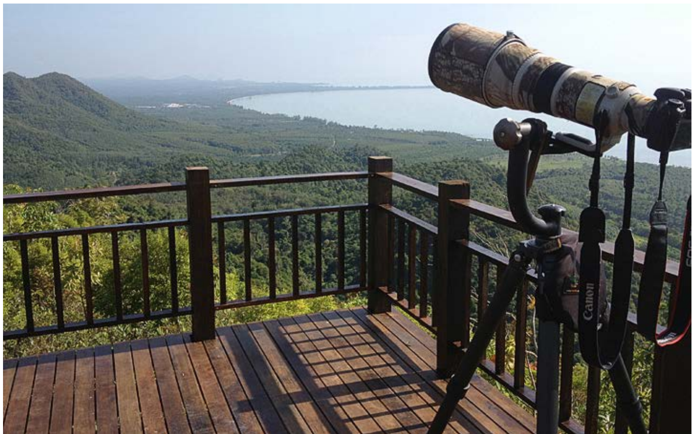
Khao Dinsor March 2013; view from Shelter Two looking north