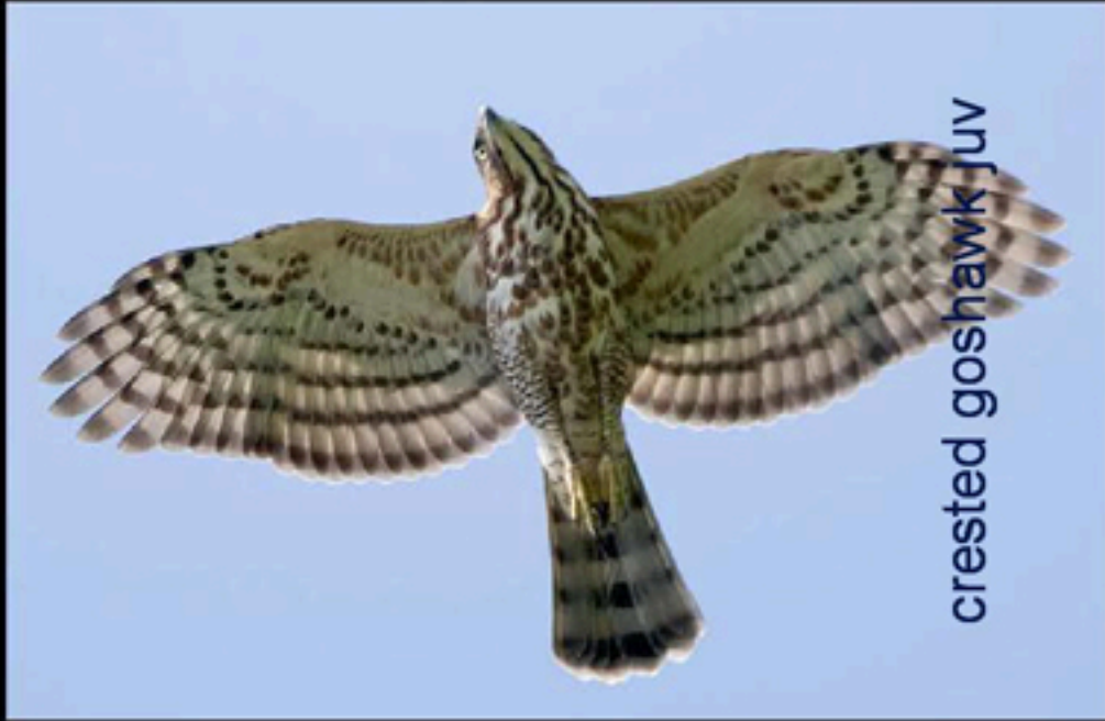
crested goshawk juv