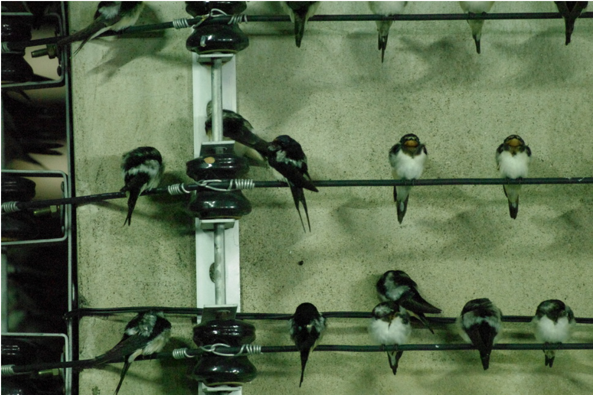
Barn Swallows roosting together at night; 16 September; Chumphon City – Wanna Phatara-Atikom MD

Early in the evening, 6:10pm (18h10) on 16 September, there was a major migration of Barn Swallows along the coast that was easily seen at nearby Thung Wua Laen Beach – most swallows were only a meter or two above the beach or adjacent South China Sea. A few thousand came through in 45 minutes. (These are not included in the 2012 Khao Dinsor count.) Several Japanese Sparrowhawks were also migrating and diving to catch (unsuccessfully) the migrating Barn Swallows. After approximately 6:45pm (18h45), with just a trace amount of light left, the Barn Swallows that had been migrating as lone birds, came together to form tight flocks – something I had never seen Barn Swallows do. Late that same evening (approximately 10:30pm; 22h30), Dr. Wanna Phatara-Atikom emailed me a photo (above) she had taken when she left her office in Chumphon City for the night. There were hundreds of Barn Swallows roosting in the parking lot of her hospital. Chumphon City is approx. 15km (9 miles) south from Thung Wua Laen Beach.