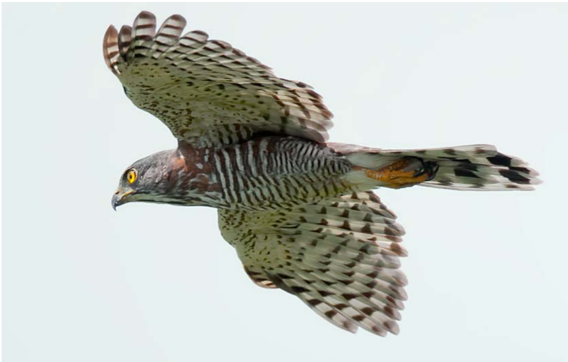
Adult male Crested Goshawk [resident], 30 August 2012 – rdc

The Crested Goshawk bred at Khao Dinsor in summer 2012, just as it did in 2010 (but not 2011). When I arrived on 15 August 2012, two young Crested Goshawks often chased one another in the area, and the young male liked to perch just outside Shelter 3. By October, I saw the young birds less frequently, possibly because the adults were nesting again in the forest south of Shelter 3. The adult male, and occasionally the female, would perform display flights in the area – extending their ventral feathers and doing a “winnowing” wing beat (shallow, rapid wing beats for 3-6 seconds) – ostensibly to warn other raptors that their territory was occupied. The guide books are not clear on which sex does such flights – our observations indicate that both sexes perform these display flights.