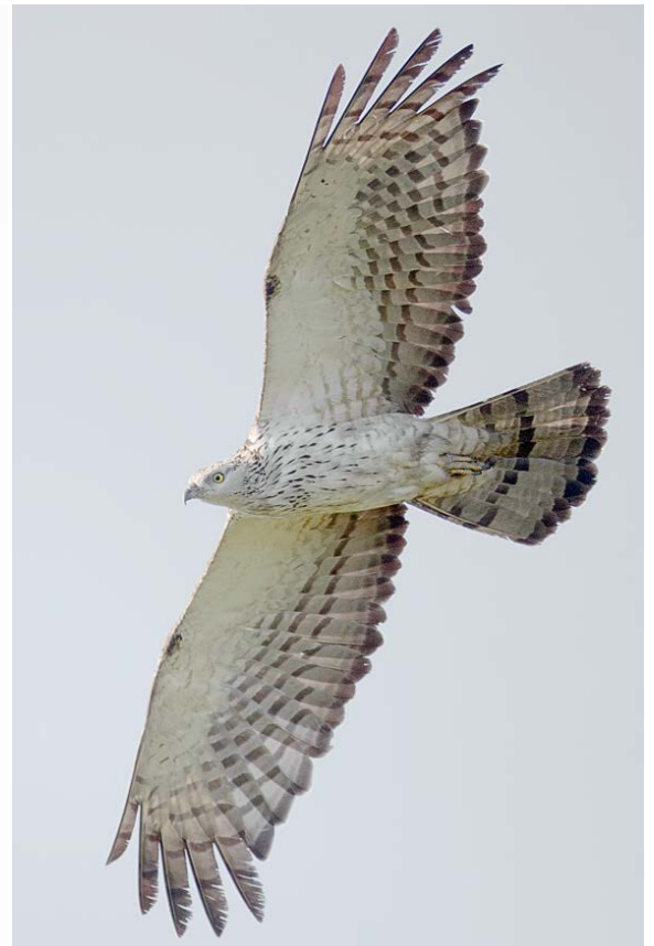
OHB (adult female), 5 October 2012 - rdc