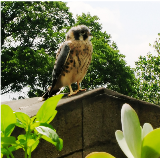
Just fledged male kestrel at NYBG (Bronx)