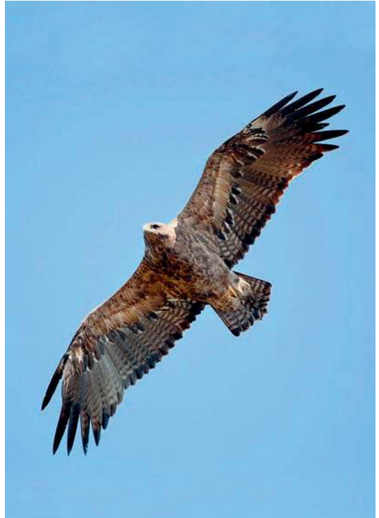
Plate 14. Adult Steppe Eagle, 24 November 2011.