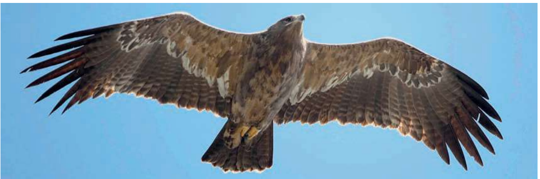
Plate 9. Fourth plumage Steppe Eagle, 21 November 2011.