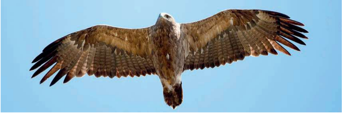
Plate 10. Adult Steppe Eagle, 23 November 2011.

and 1999 (1 November–28 February), but none has been seen since (Lim 2009).