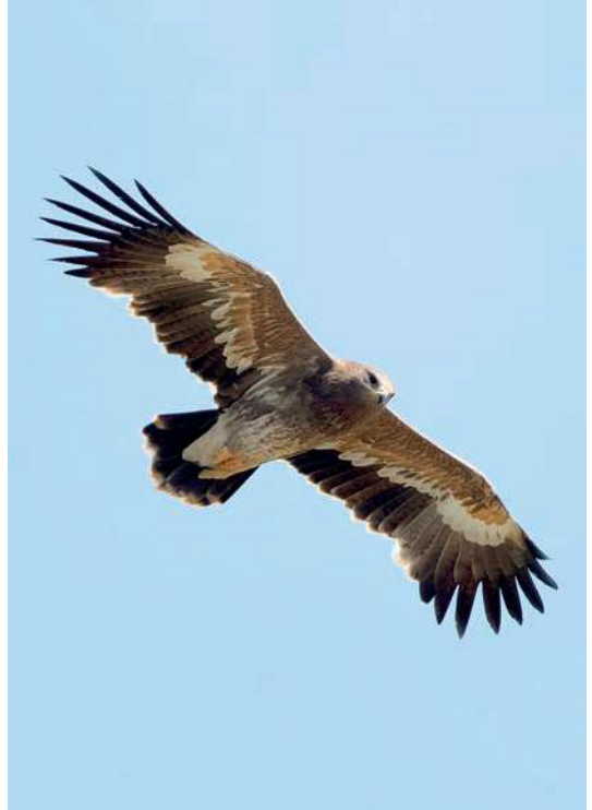
Plate 12. Second plumage Steppe Eagle, 22 November 2011.