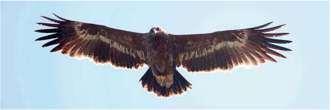
Plate 7. Second plumage Steppe Eagle, 19 November 2011.