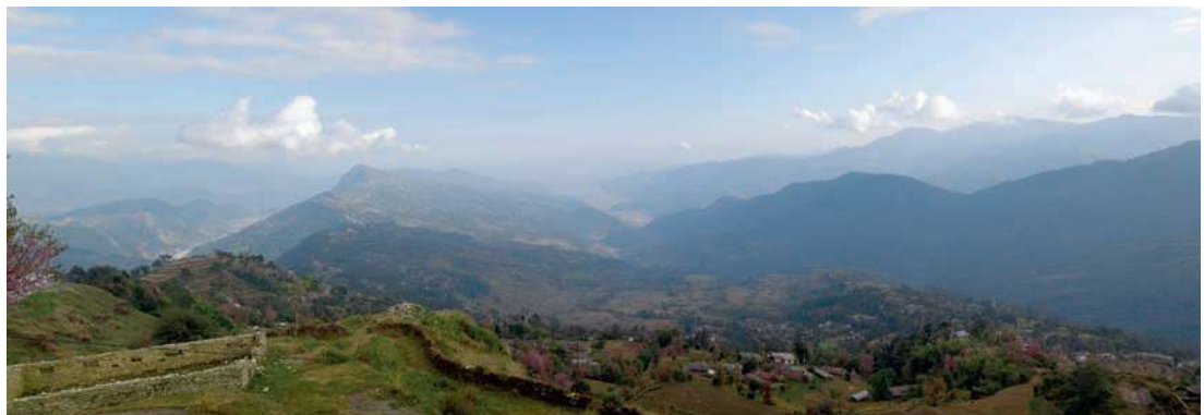
Plate 1. View from the raptor watch site at Khare, Paudur Hill, Nepal, 25 November 2011.

All images were taken at the raptor watch site at Khare, Paudur Hill, Nepal.