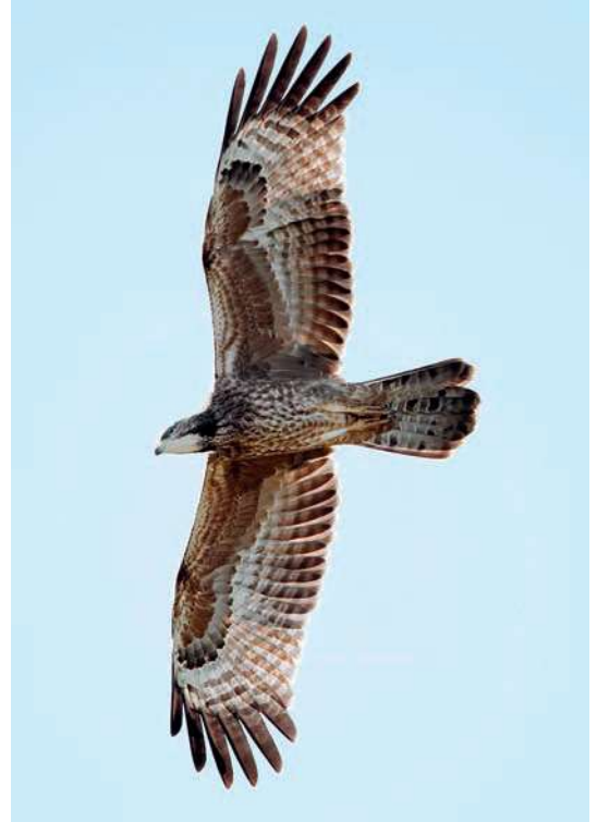
Plate 3. Juvenile (first year) Oriental Honey Buzzard Pernis ptilorhynchus , 22 November 2011.

Figure 1. ▲ Khare (Nepal) – location of current migration study at 1,646 m; the town of Dhampus is directly north across a valley at approx. 1,800 m. (1) Ghasa in the Kaligandaki valley, (2) Kathmandu Valley, (3) Ilam District, (4) Bardia National Park, (5) Jhatingri and Dharamsala, Himachal Pradesh, India, (6) Chihkiang [Hongjiang], China, (7) Eastern Tibet, (8) Kalamaili, Xinjiang Province, China.