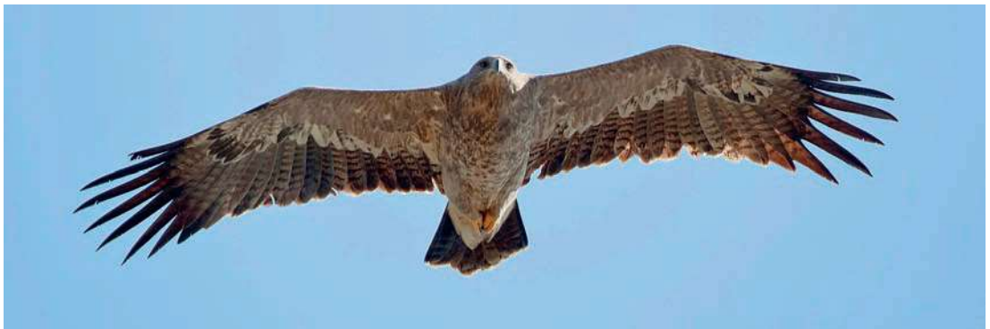
Plate 8. Third plumage Steppe Eagle, 21 November 2011.