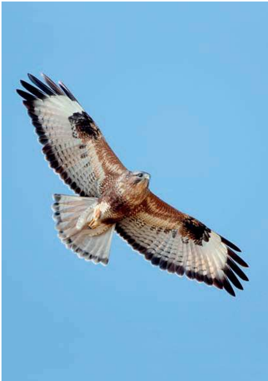
Plate 4. Common Buzzard Buteo buteo vulpinus , 22 November 2011.