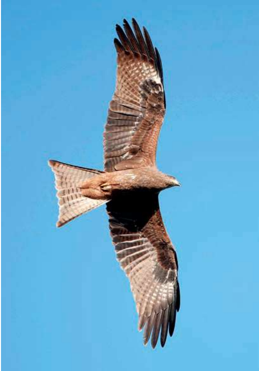
Plate 2. Adult Black Kite Milvus migrans , 19 November 2011.