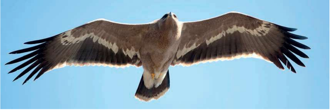
Plate 6. First plumage (juvenile) Steppe Eagle Aquila nipalensis nipalensis , 24 November 2011.