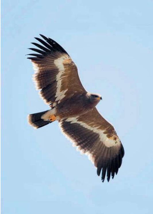
Plate 11. First plumage (juvenile) Steppe Eagle, 20 November 2011.