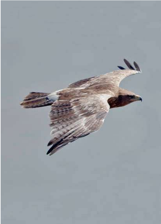
Plate 13. Third or fourth plumage Steppe Eagle, 23 November 2011.